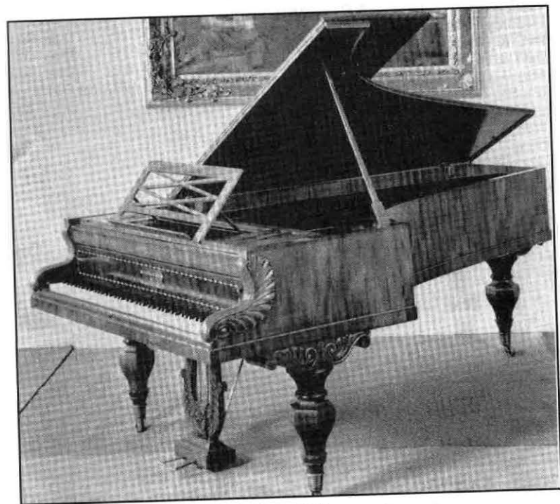
Ibach Grand Piano Made In Germany In 1848