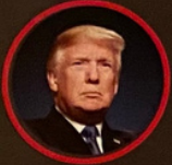
PRESIDENT OF THE UNITED STATES DONALD J TRUMP

Please use this sample ballot to help us TAKE AMERICA BACK from the people who are PURPOSELY DESTROYING AMERICA.