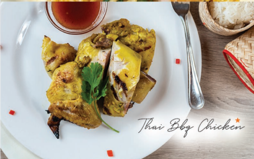
Thai BBQ★ Chicken