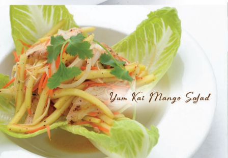
Yum Kai Mango Salad