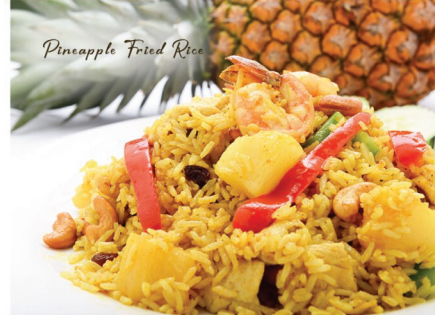
Pineapple Fried Rice