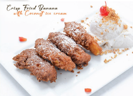
Crisp Fried Banana with Coconut Ice cream