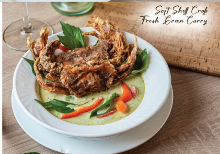
Soft Shell Crab Fresh Green Curry