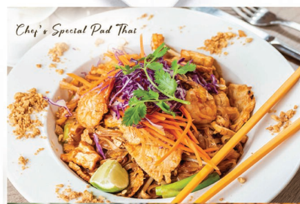
Chef's Special Pad Thai