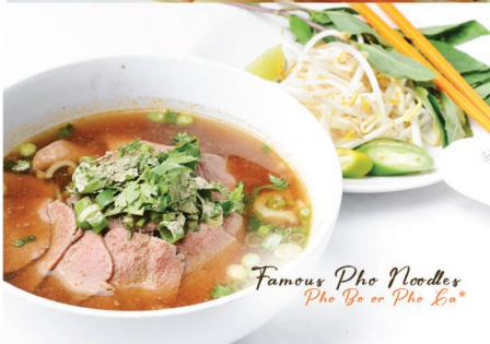
Famous Pho Noodles Pho Bo or Pho Lo★