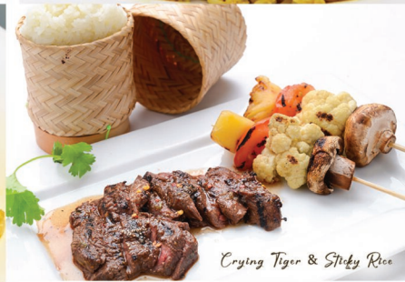
Crying Tiger & Sticky Rice