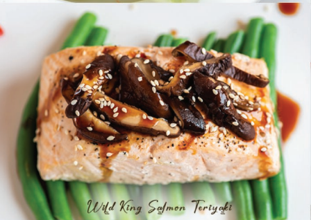
Wild King Salmon Teriyaki