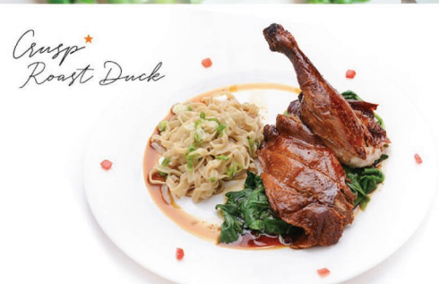
Crisp★ Roast Duck