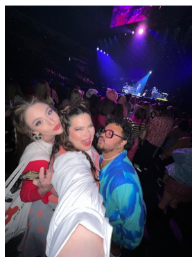
Harry Styles Concert