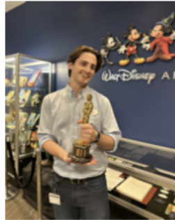
A real Oscar!