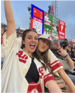
hot dogs consumed: 4