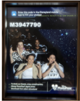
"Let's do something American!"