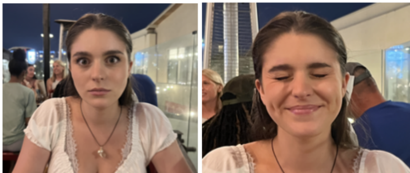
Quite literally the only pictures taken on our anniversary

On July 27th, we celebrated our 2nd anniversary and decided to buy plane tickets to Italy!!!