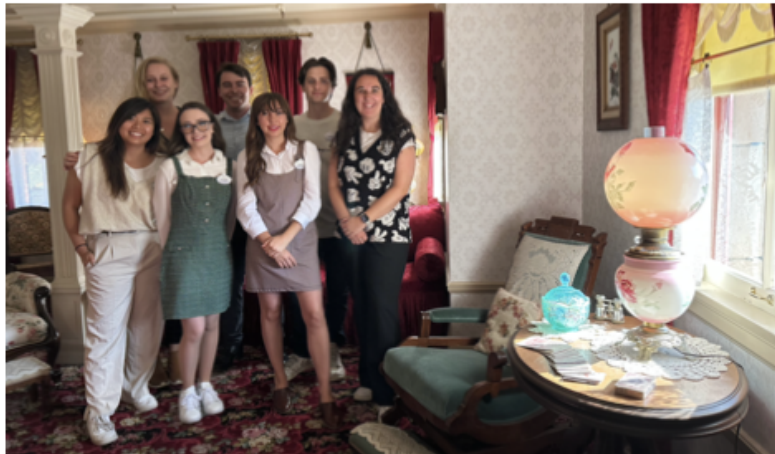
Walt's Disneyland apartment

On July 27th, we celebrated our 2nd anniversary and decided to buy plane tickets to Italy!!!