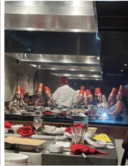
Benihana (round 2)