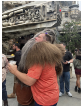
Chewbacca hugs = best hugs