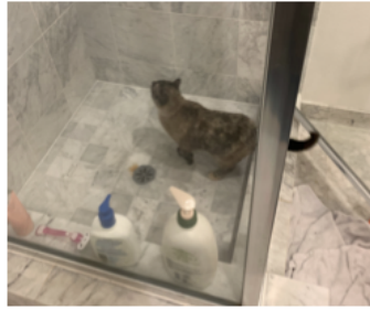
The only photo we have from move-in day: Nala investigating the shower

Taya started acting classes! She also learned to sew.