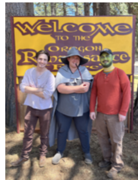
From right to left: the goblin, the party city wizard, and the 'i swung by goodwill on the way here' hobbit -