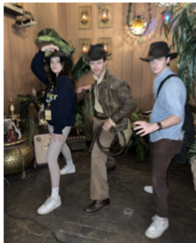
He led the project for Indiana Jones at Disneyland