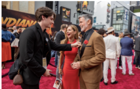
His “coworkers” that night consisted of Steven Spielberg, Gabriel Iglesias, Ke Huy Quan, and Harrison Ford.