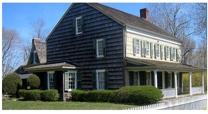
from the mid-18th century Hallock Homestead (above) to the Depression-era Cichanowicz Farmhouse.

Hallockville is listed on the National Register of Historic Places and is a Riverhead Town Landmark, comprised of 28 acres along with 19 historic houses, barns and outbuildings, ranging