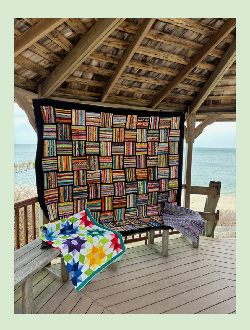
2025 Hallockville Quilt Exhibit

Saturday, September 13th from 10 am to 4 pm Sunday, September 14th from 10 am to 4 pm