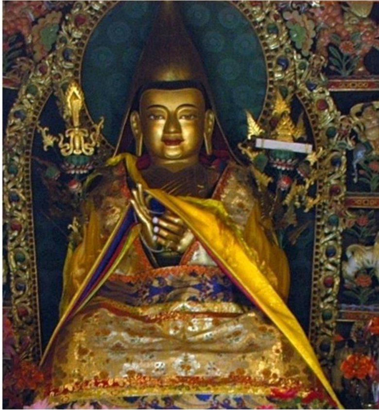
Je Rinpoche (1357-1419) Lama Tsongkhapa