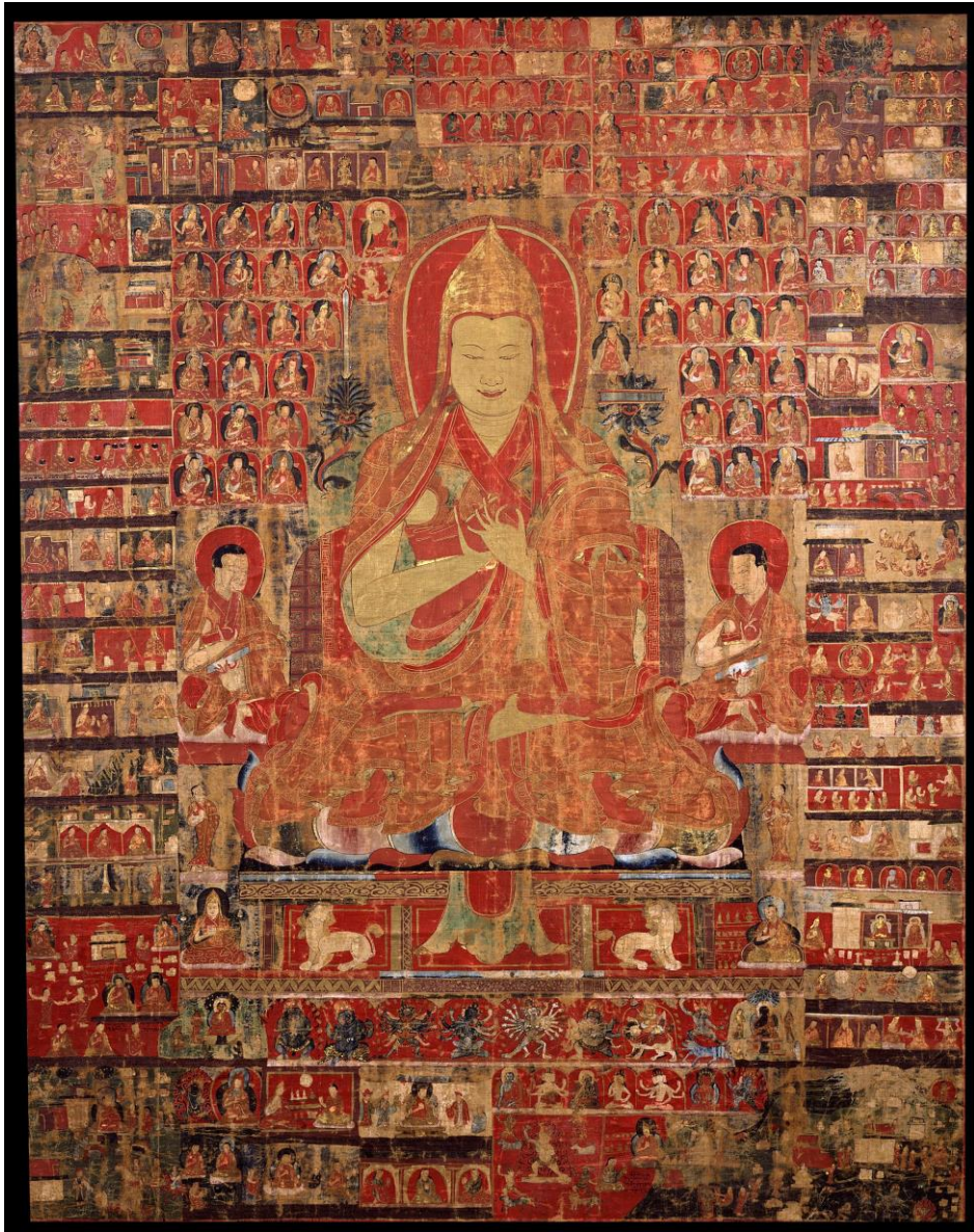
Lama Tsongkhapa (1357-1419): Je Rinpoche