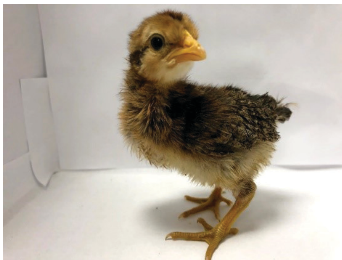
Figure 12. Chicks need warm conditions and protection from drafts until they are fully feathered.

PO Box 529 Lebanon, Missouri 65536 (417) 532-4581 http://www.cacklehatchery.com