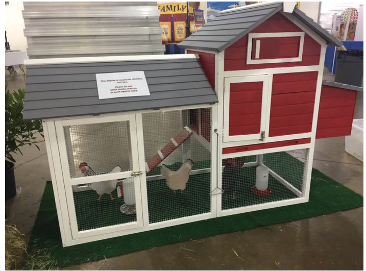
Figure 2. Attractive coops may be purchased or constructed.

If your coop will be visible from outside your property, consider its appearance and the impression it may leave on your neighbors. Your coop can be a bright spot in the neighborhood or a point of contention, largely based on its appearance and upkeep. Poultry housing structures may also fall under your county or city ordinance and have requirements for required setbacks or permits. Again, refer to your local ordinance to verify standards.