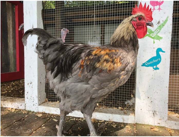
Figure 6. Roosters are not required for hens to lay eggs.