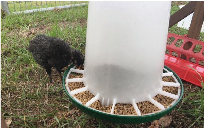
Figure 5. Commercial feeds are formulated to provide nutrition based on stage of growth.

consume layer feed. If you have a mixed species flock (e.g., guinea hens, turkeys, waterfowl, etc.), all-flock feed is available and formulated to provide for specific nutrient requirements for various species.