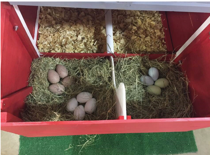
Figure 7. Keep nesting boxes tidy to reduce food safety risks.

Nesting boxes should be checked at least once a day for eggs. Eggs should not be allowed to accumulate in the nests. Otherwise, the hens will go out of egg production and want to sit on the eggs to incubate them. This type of hen is commonly referred to as a “broody” hen. Keep nesting boxes clean to help prevent dirty eggs. The more time the egg spends in the nest, the more likely it is to become dirty, broken, or low quality. Ceramic or wooden eggs can be used to help encourage your hens to use the nesting boxes.