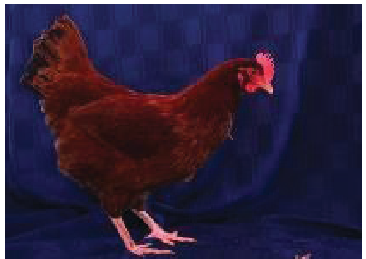
Figure 11. Rhode Island Red hen.