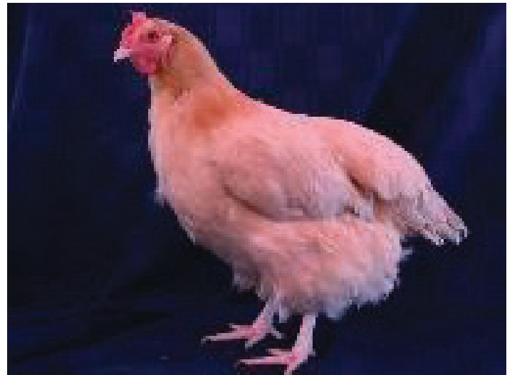
Figure 9. Buff Orpington hen.

Mixing breeds causes no issues within a chicken flock, and is one of the highlights of owning chickens. Having a variety of breeds that lay eggs of different shapes, sizes, and colors will brighten your egg basket and your coop. Care should be taken if mixing standard size birds and bantam varieties. Bantams are half to a quarter the size of a standard chicken and will lay smaller eggs. It is important to note that chickens do develop a pecking order and introducing new birds to an established flock may disrupt the pecking order. Young birds introduced to a new flock may experience bullying from older hens so it is best for new birds to be introduced slowly over a period of time to reduce the risk of injuries. Introducing new birds at night is a common practice to help reduce conflict in the flock.