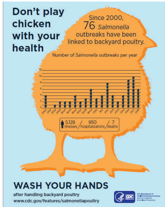
Figure 13. Chickens may carry Salmonella , which has led to illness and deaths in recent years.

in areas where food or drink is prepared, served, or stored. Be sure to thoroughly cook any eggs collected from your hens. Stay outdoors when cleaning any equipment or materials used to raise or care for live poultry, such as cages or feed or water containers. Buy birds from hatcheries that participate in the US Department of Agriculture National Poultry Improvement Plan (USDA-NPIP) to reduce risk of disease.