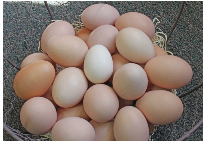
Figure 1. Backyard chickens can provide colorful eggs and companionship.

of birds, establishing a setback from neighboring property for housing, and a general prohibition of male chickens, or roosters. Most prohibit roaming poultry and are often enforced based on complaint. These ordinances sometimes include an exemption for student educational projects. Note that while chickens may be permitted, other livestock of interest such as ducks or turkeys may not be allowed. Make friends with your neighbors and verify any regulations to protect yourself and your birds from any problems. To confirm your zoning designation, visit the website of your city or county's Planning and Zoning department or contact them directly. You can also search your local ordinances at https://library.municode.com/fl .