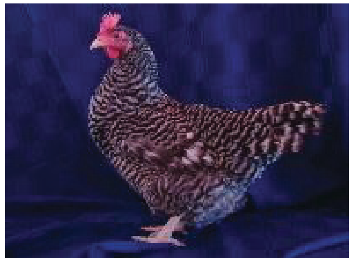
Figure 10. Barred Rock hen