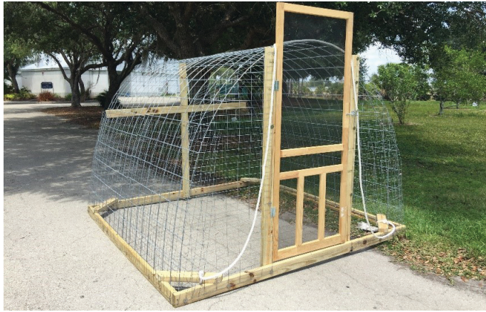
Figure 3. Mobile coops can help reduce damage to grass.

your grass to determine when to rotate the location of your mobile coop. Also note that the wider distribution of waste will increase the distribution of any pathogens it contains, such as Salmonella , which is commonly found in chicken droppings. Keep in mind that in the event of a hurricane or major weather event, mobile coops will need to be stored in an enclosed area to avoid becoming a hazard.