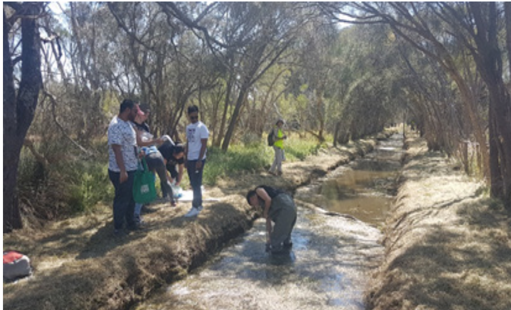
UWA students helping with geophysics and sampling in the Chapman St Drain