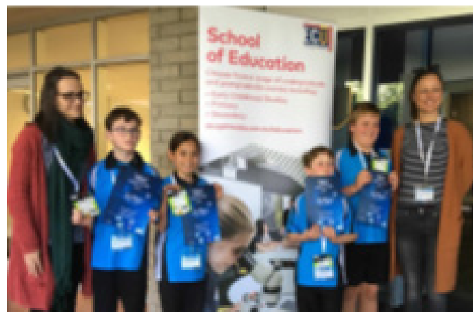
ICT Young Explorers Competition (above) Ashfield vs Wildcats Basketball Game (below)

ASHFIELD Gardening & Maintenance Qualified Tradesperson . National Police Clearance . White Card . Fully Insured