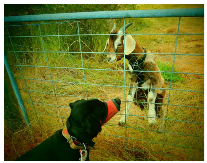
Billy the Kid vs Dangerous Dog on the Ashfield Flats or send your best caption to PO Box 297 Bayswater.