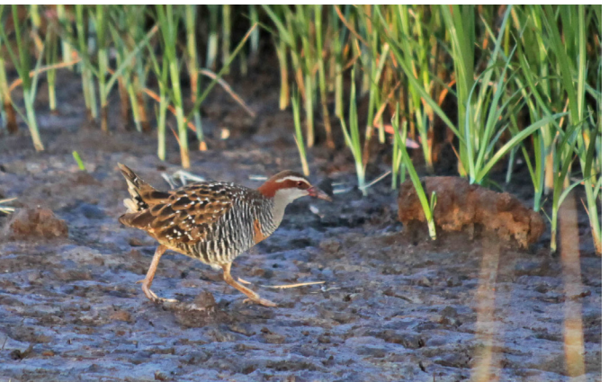
The elusive Buff Banded Rail

Throughout the year quite a few of the larger birds are obvious but there are also some migratory species that only occur at particular times of the year. For instance in early October the Rainbow Bee-eaters and Kingfishers arrive