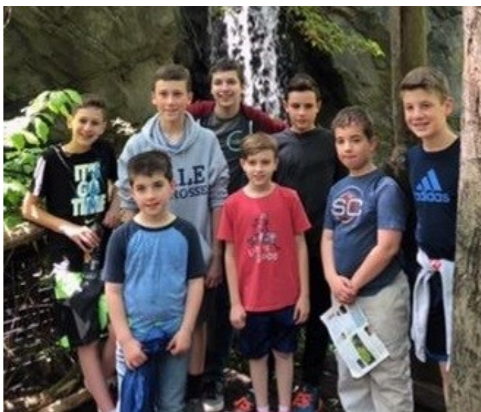
BIRS students on a field trip to the Bronx Zoo

B'nai Israel Religious School is grateful to The Jewish Federation Endowment for funding our animal-focused program "Two by Two"—Inspiring Jewish Learning through Bible Stories & Animals through next year. This program will include an Aquatic Touch Tank, allowing students to make connections with the Bible stories of Creation and Jonah and the Big Fish. Students will also visit a local nature center where they will see farm animals and explore the story of Noah's Ark. In June, on the last day of school, students went to the Bronx Zoo, where they encountered a variety of animals. They participated in a Bronx Zoo Scavenger Hunt, and were able to learn the Hebrew names of some of their favorite species. While all zoo exhibits were popular with students, some of the highlights included Congo Gorilla Forest and Butterfly Garden. During our "Two by Two" programs, students are learning the Jewish values of caring for animals, the vital role that animals play in our ecosystem, and how animals help humans thrive exemplified by partnering with companion and service dogs.