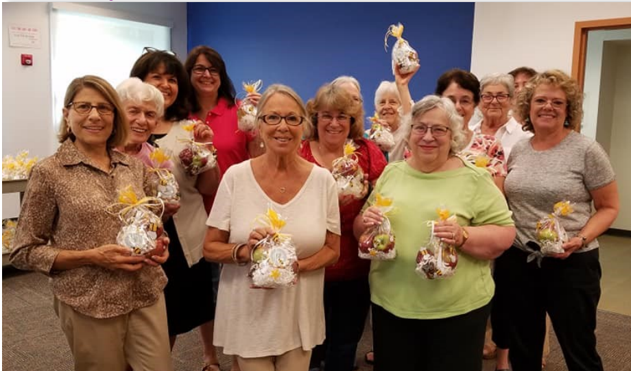
Pictured above are some of Sisterhood's amazing members.