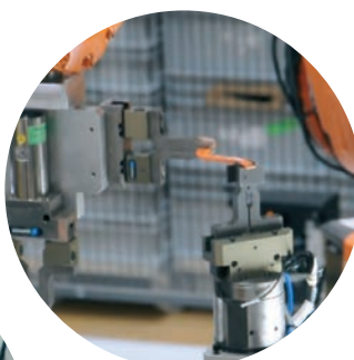
Core competence in development, process and technology