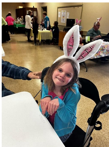
Emersyn was an adorable bunny at our Good Friday fish fry!