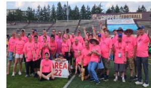
Young Athlete's Program Offered