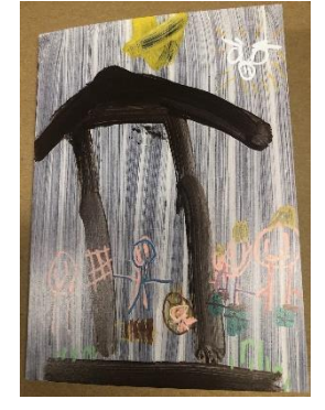
Charles Switalski Kindergarten