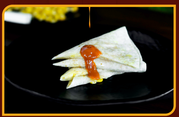
CHEESE CORN QUASADILLA