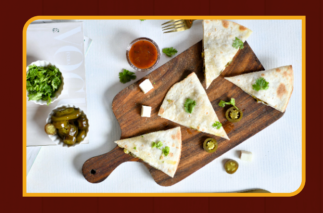
CHEESE JALEPENOS QUASADILLA