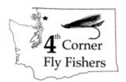
P.O. Box 1543 Bellingham, WA 98227