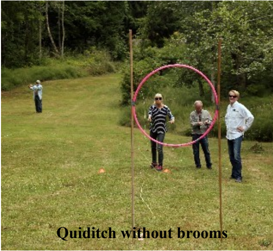
Quiditch without brooms