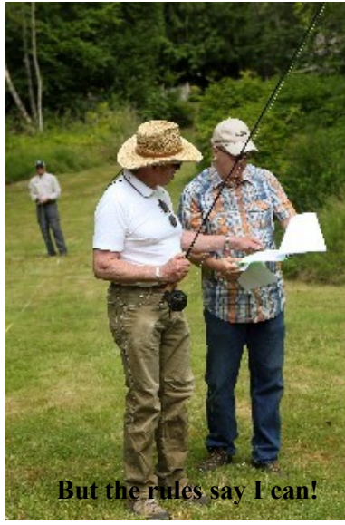
But the rules say I can!