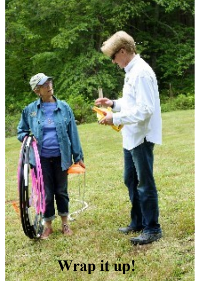
Wrap it up!