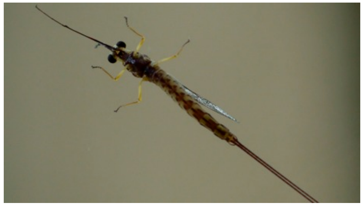
(What the fish see....)