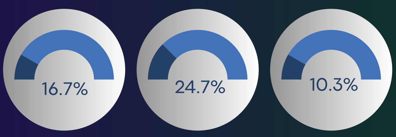
Training & Technical Assistance