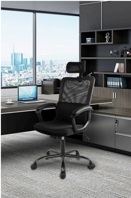
Inbox Zero ergonomic mesh executive chair