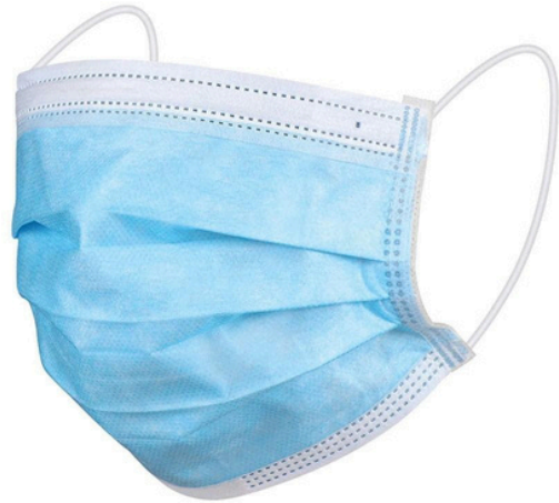
ISC Preferred ASTM Level 2 surgical face mask 50/box