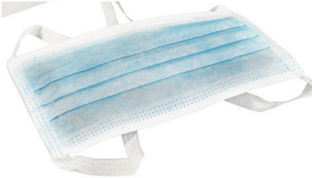
Dynarex Level 1 surgical face mask 50/box