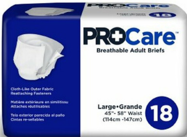
Carewell adult briefs (45-58" waist ) Lg 18/pk case of 72