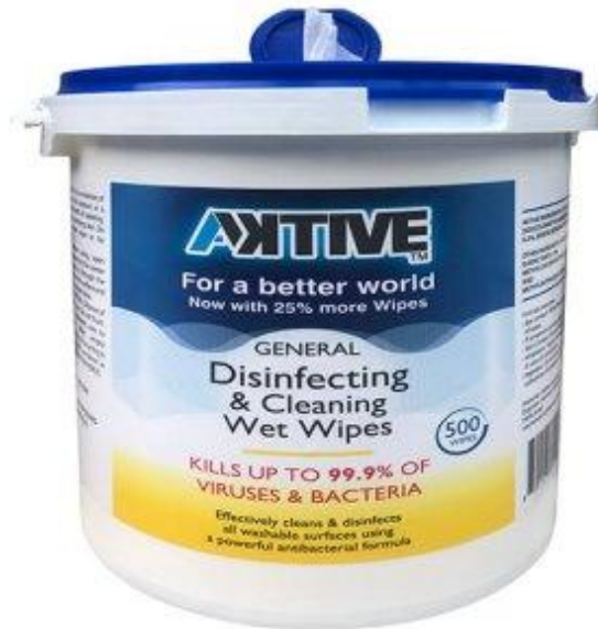
Aktive Disinfecting & Cleaning Wet Wipes 500/count