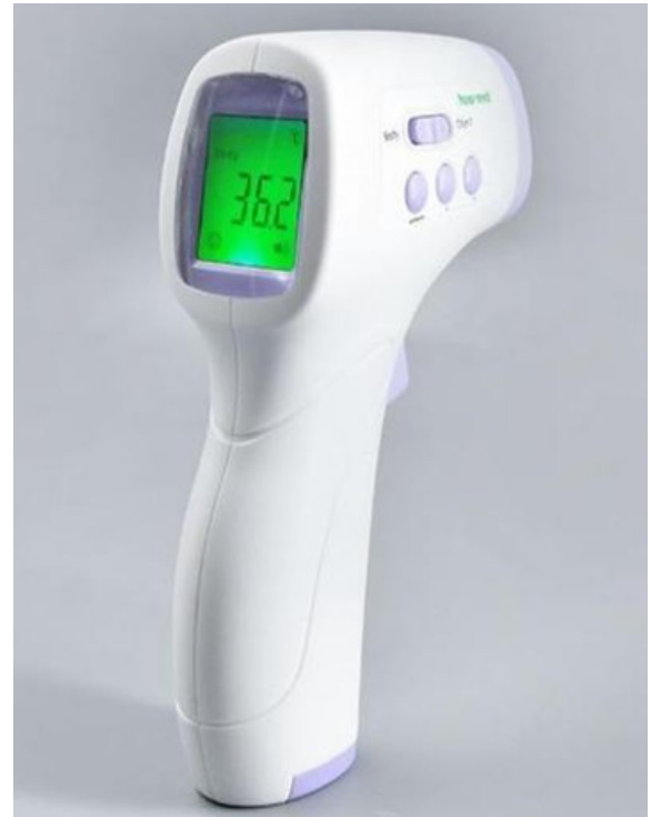
Emergency Med Products non-contact infrared forehead thermometer