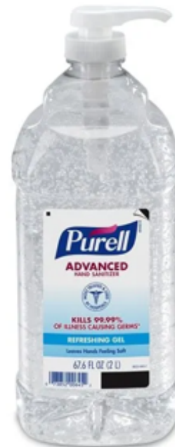
Purell hand sanitizer 20 oz gel with pump