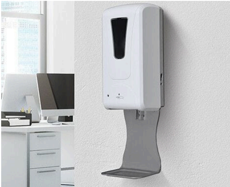
Tree Top Products touch free automatic wall mounted liquid soap dispenser with tray 1000ml