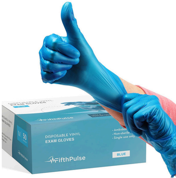
Fifth Pulse vinyl disposable exam gloves (powder free) S, M, L 100/box