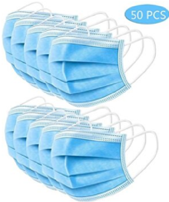
Ninomed ASTM Level 3 surgical face mask 50/box