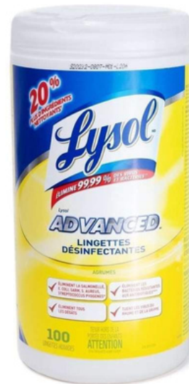
Lysol disinfectant wipes 100 count