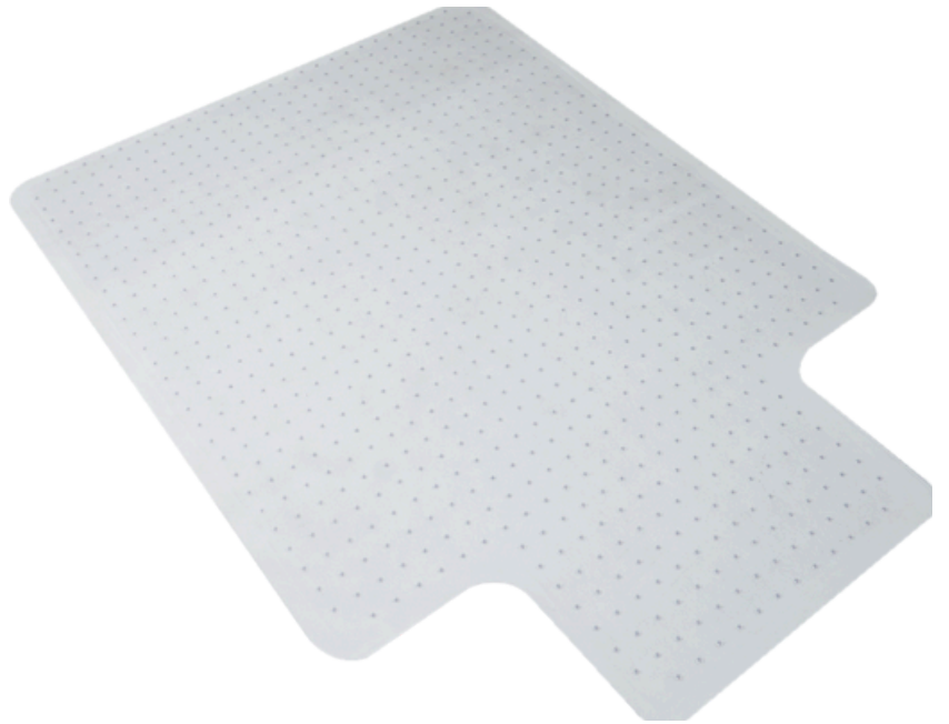
Symple Stuff medium pile carpet beveled chair mat