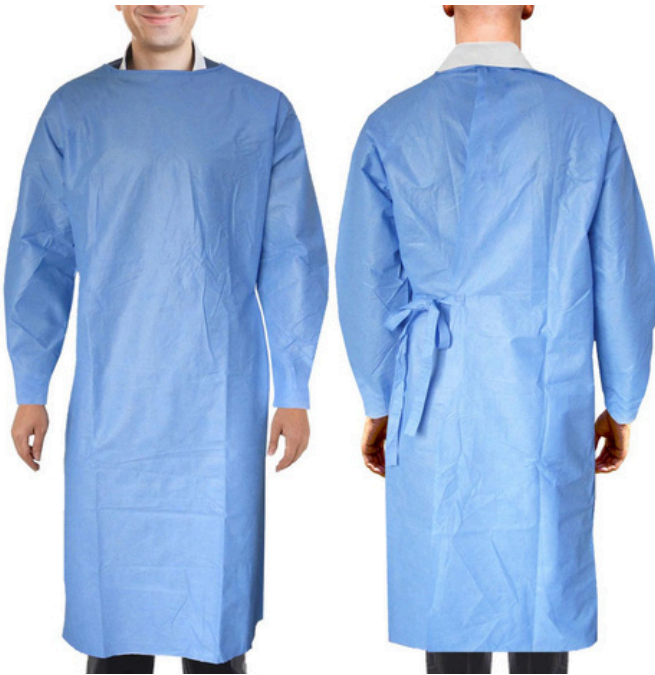
Vizocare Level 2 non-surgical isolation gown