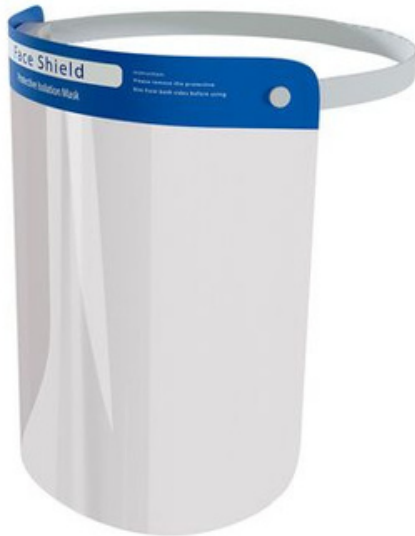
Mersi distribution face shields anti-fog pvc