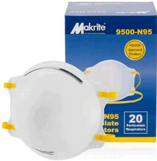
Makrite N95 Niosh mask 20/pk white