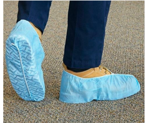
Uline skid resistant shoe covers size 6-11, 12-15 blue 150/carton