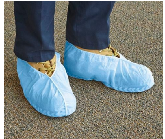
Uline standard shoe covers size 6-11, 12-15 blue 150/carton