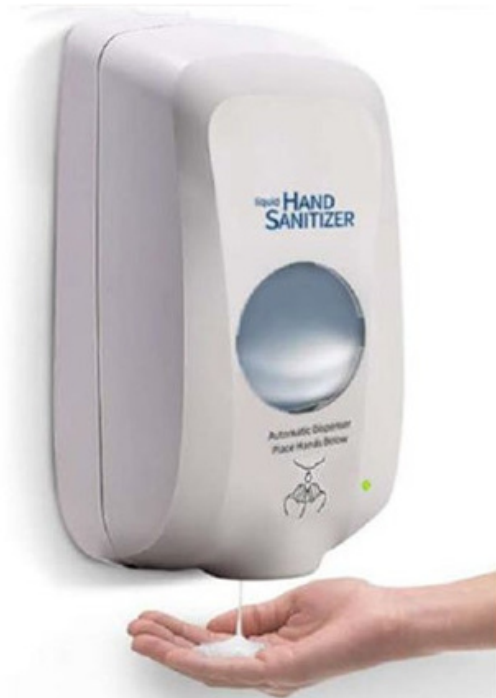
Alpine wall mounted hands free automatic hand sanitizer dispenser 1000 ml (white)