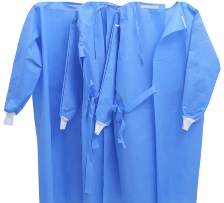
Vizocare Level 3 non-surgical isolation gown