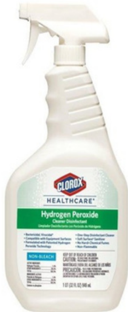
Clorox hydrogen peroxide disinfecting spray bottle 32 oz