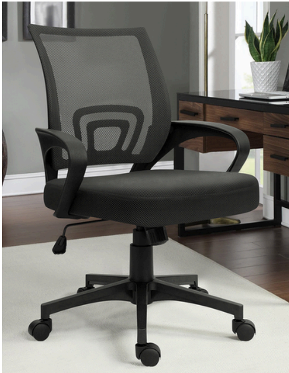
The Twillery Co.® ergonomic mesh chair