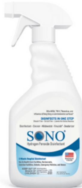
SONO hydrogen peroxide disinfecting spray bottle 32 oz