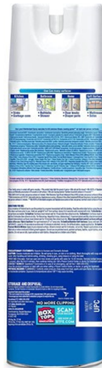
Lysol/Clorox disinfectant spray 19 oz