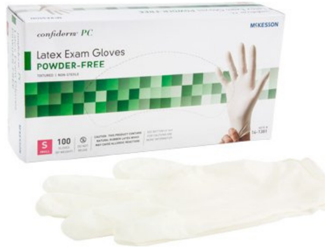
McKesson medical exam latex (powder free) non sterile gloves S, M, L, XL 100/box