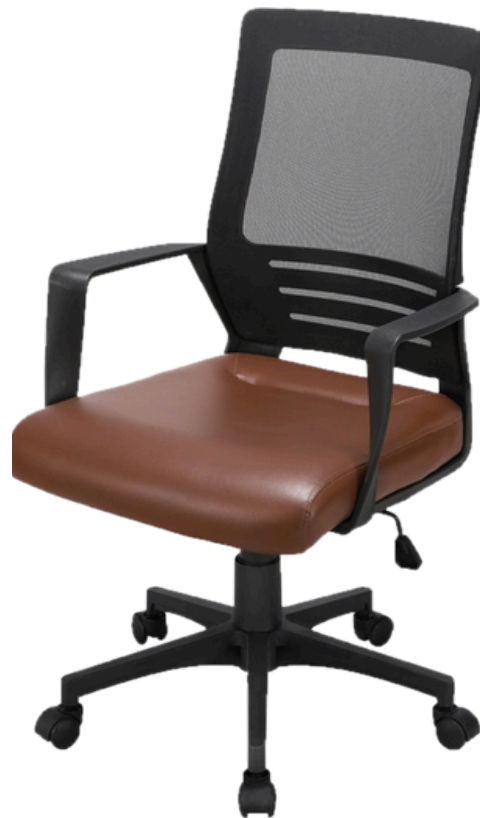
Executive Chair sku85938372