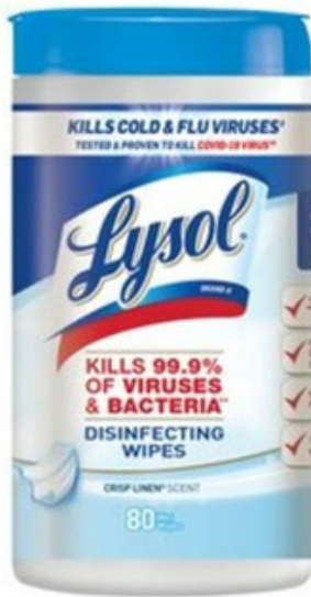
Lysol disinfectant wipes 80 count