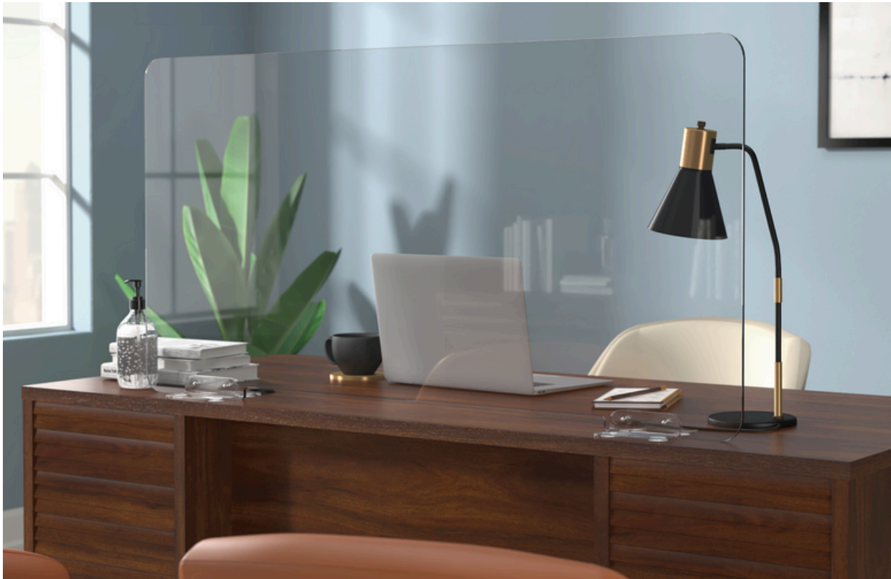
Sauder 1 panel freestanding room divider sneeze guard