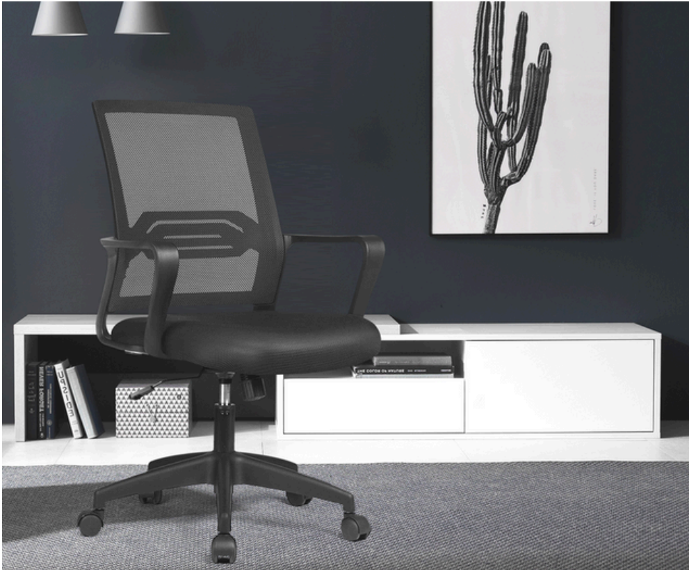
Inbox Zero ergonomic mesh chair