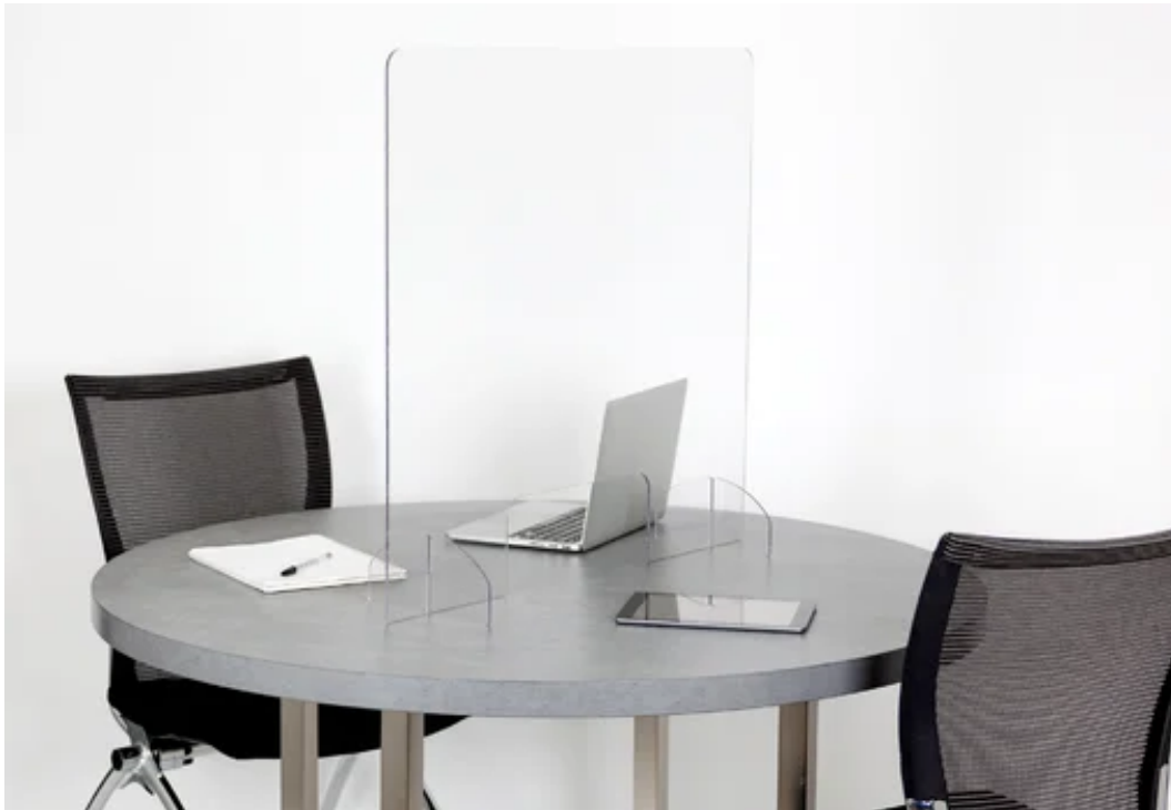
Safco Products desk privacy panel sneeze guard