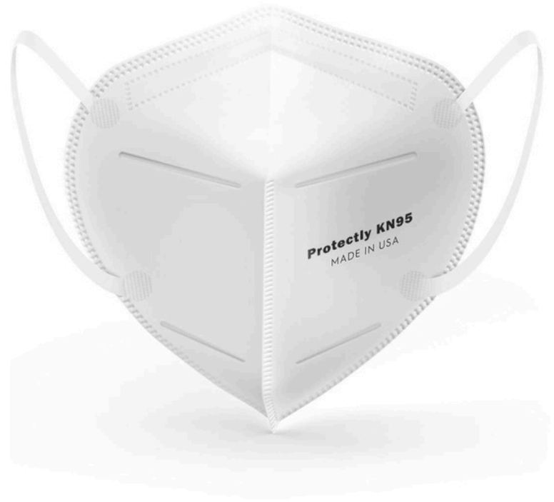
Protectly KN-95 mask 10/pk white