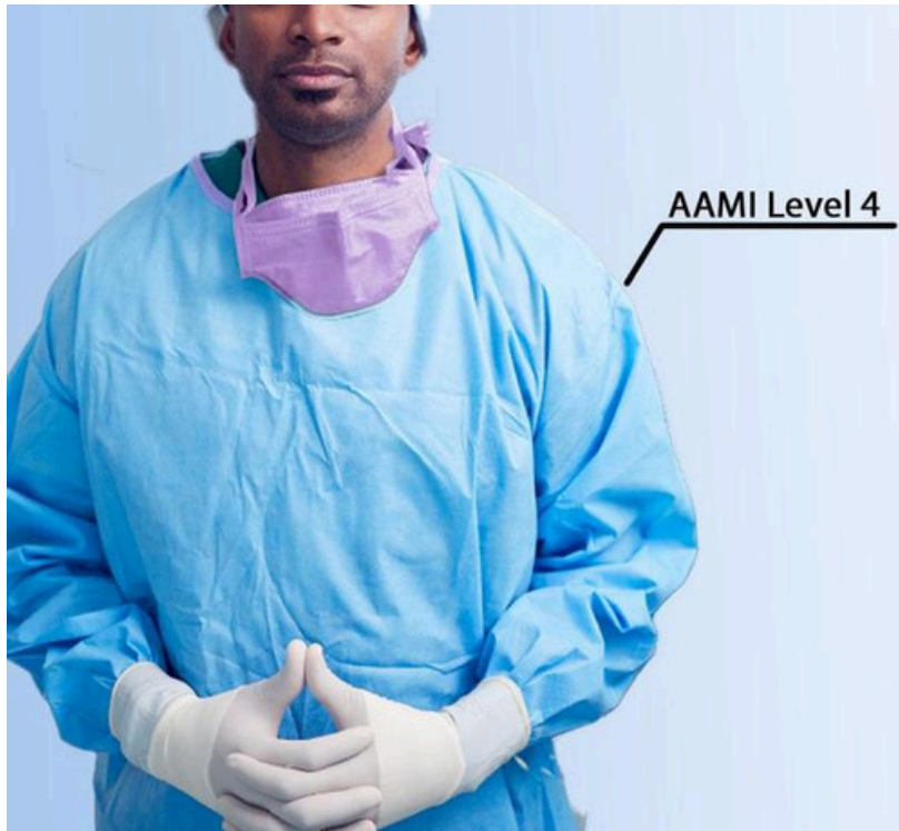
Vizocare Level 4 non-surgical isolation gown