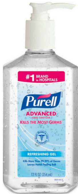
Purell hand sanitizer 8 oz / 12 oz gel with pump