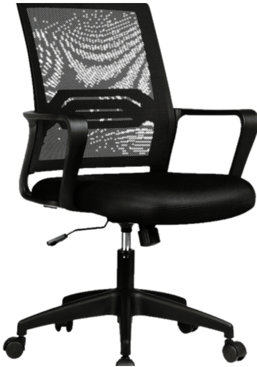
Ergonomic mesh chair