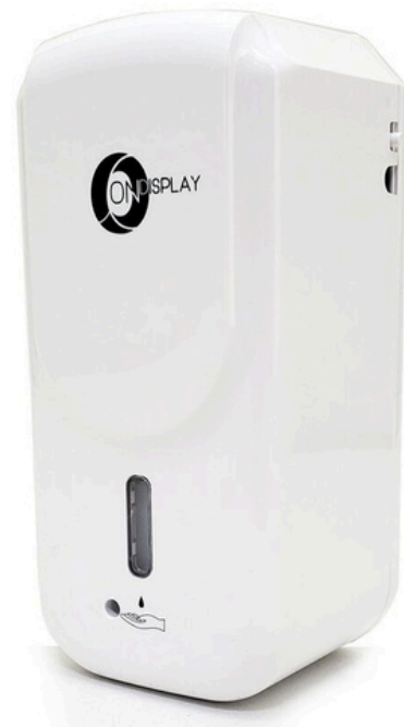
Vandue Corporation touchless wall mounted soap dispenser 1 liter (white)