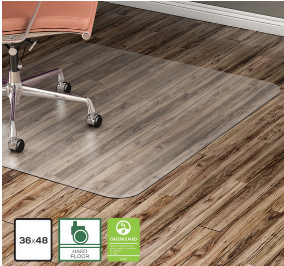
Deflect-O hard floor straight standard lip chair mat