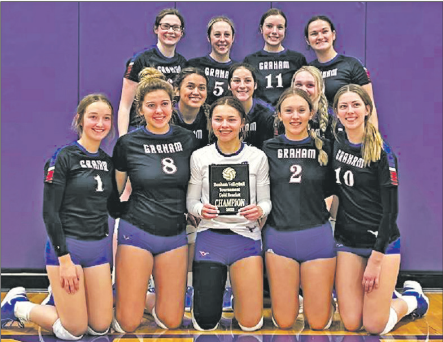
At top, the Graham Lady Blues volleyball team took first place last weekend in the Bonham Tournament. At bottom, the Newcastle Ladycats volleyball team took first place at the Aspermont Tournament. Both teams finished with undefeated records.