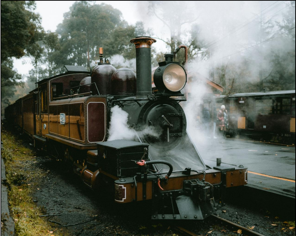
Puffing Billy– Photo: Ayush Shakya - UnSplash Licence

Like some lolly bags from our childhoods this quiz has a lot of variety in its questions.