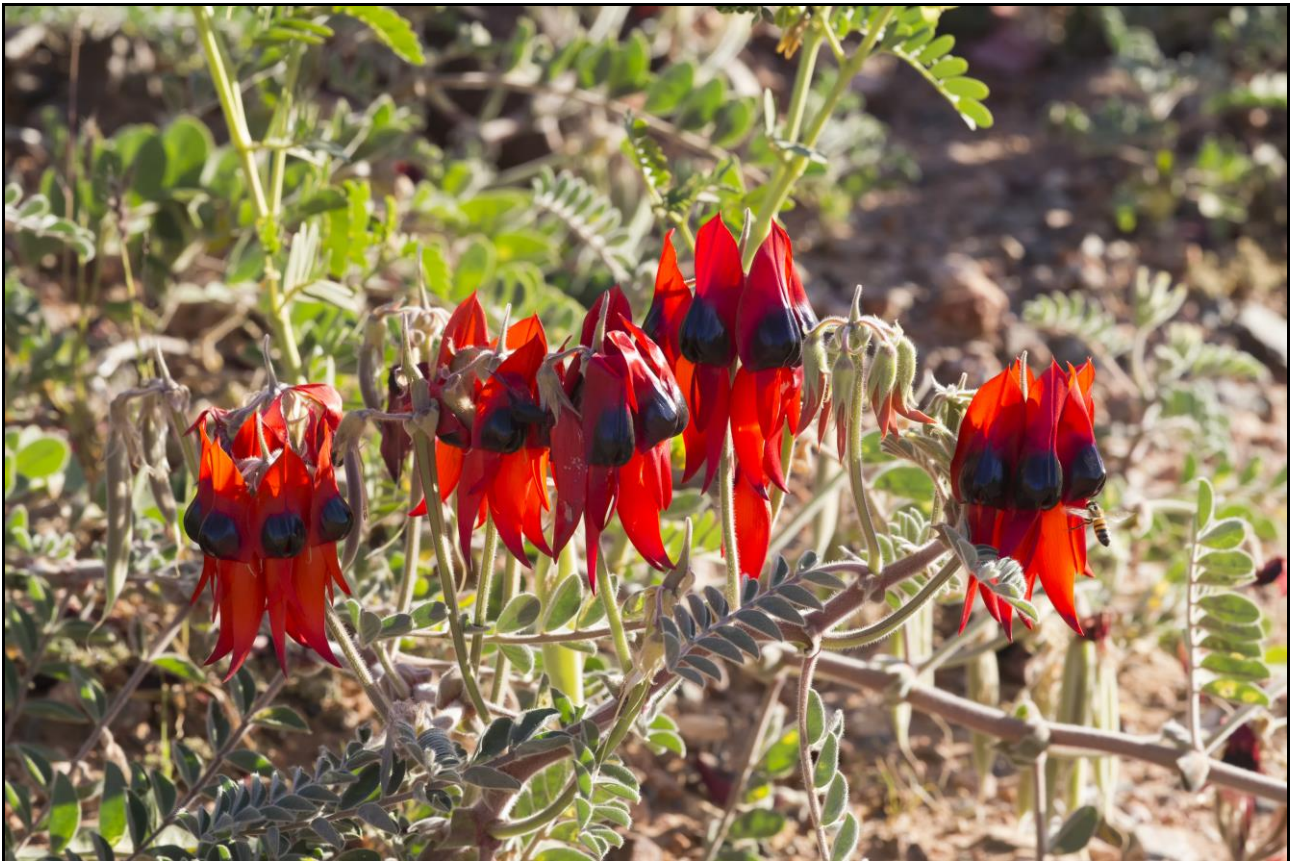
Sturt Desert Pea

Like the dry desert, this quiz has less questions than the other quizzes.