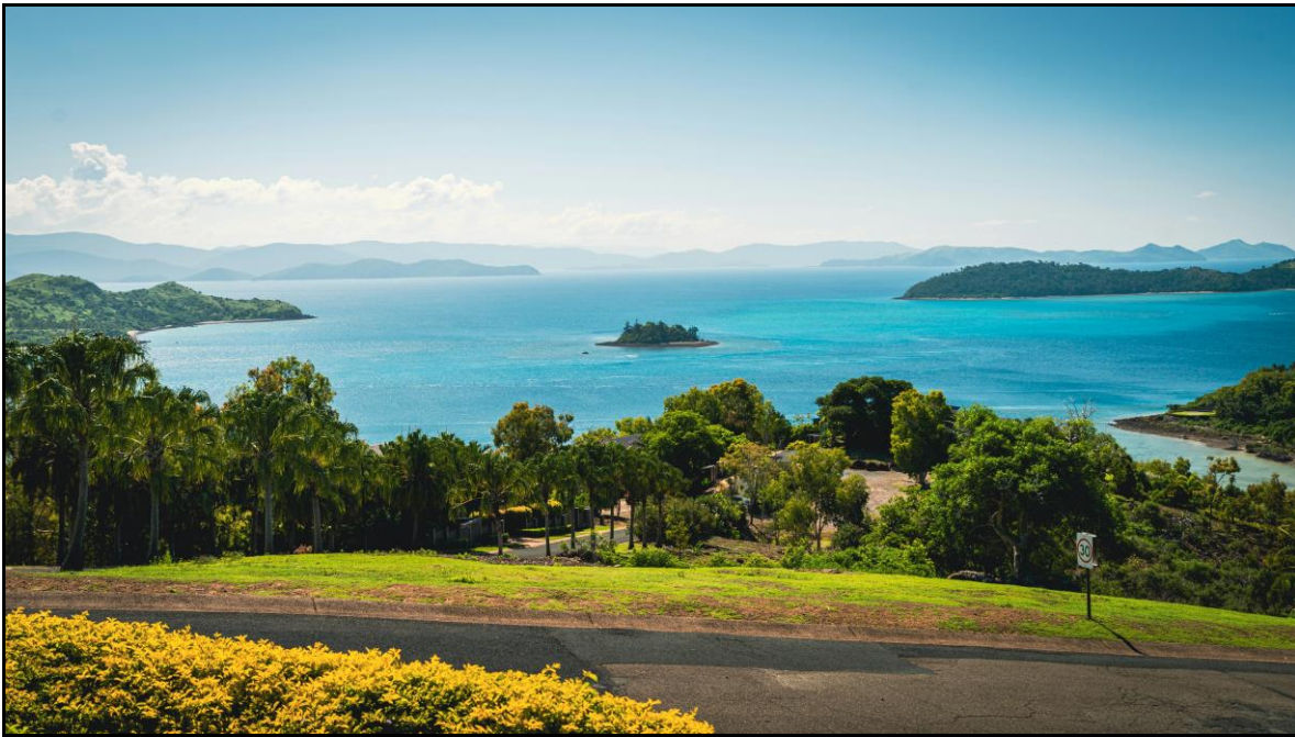
The Whitsunday Islands

Australia might be girt by sea but it also has plenty of islands. Many of these islands have a strong connection with our history either having being visited by important people or been named after them. This quiz focuses on some of them.