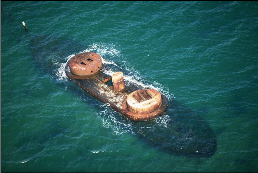
HMAS Cerberus