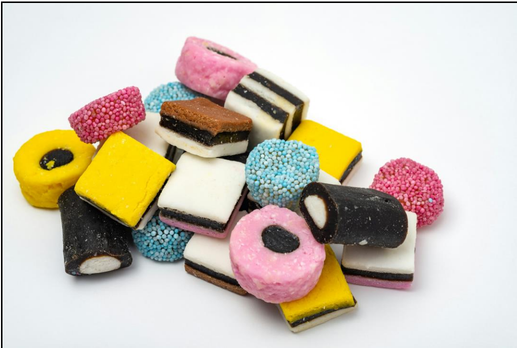
Licorice All-Sorts

Like Licorice All-Sorts, this quiz has a bit of everything.