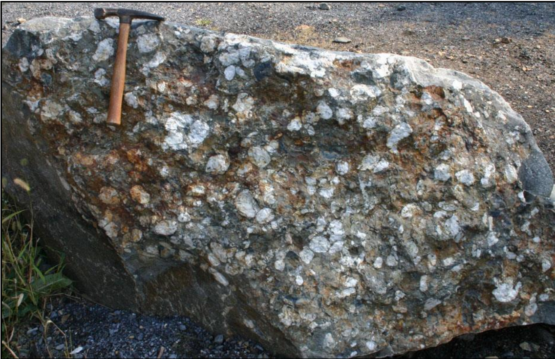
Conglomerate – Photo: Jstuby- UnSplash Licence

Conglomerate is a rock made of various smaller rounded rock particles. They are bound together by hardened sediments. It can sometimes be found while on the wallaby. In some ways it is just like Australia - made up of many different parts!