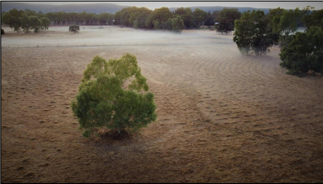
Darling Downs

Australia's states are divided up informally into regions. This helps us identify areas that have important features in common.