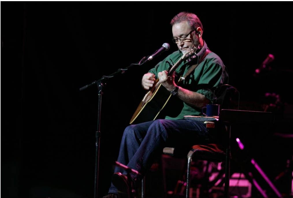
John Williamson

John Williamson has spent a lot of time in the Outback, which features strongly in many of his songs. In this quiz we refer to him as 'JW'.