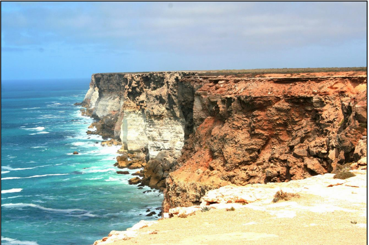
The Great Australian Bight

Our National Anthem (Advance Australia Fair) says Australia is 'girt' or surrounded by sea'. This has more advantages than disadvantages. This Quiz will touch on these. John Williamson also wrote a very amusing song about Australia being 'Girt by sea'.