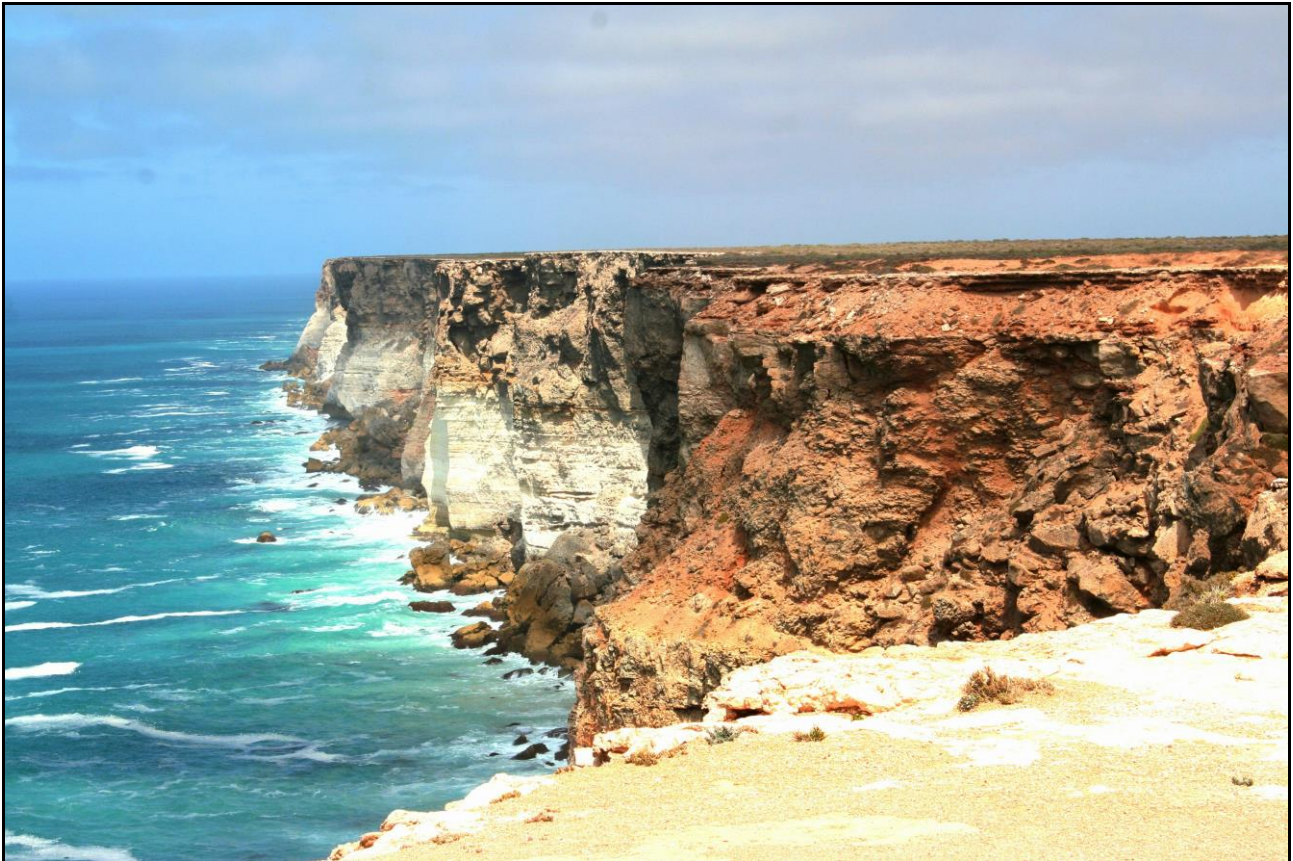
The Great Australian Bight

Our National Anthem (Advance Australia Fair) says Australia is 'girt' or surrounded by sea'. This has more advantages than disadvantages. This Quiz will touch on these. John Williamson also wrote a very amusing song about Australia being 'Girt by sea'.