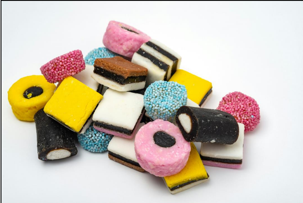
Licorice All-Sorts

Like Licorice All-Sorts, this quiz has a bit of everything.