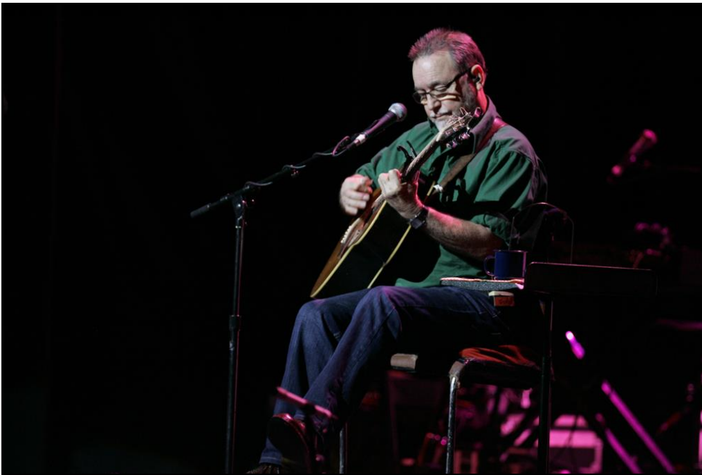
John Williamson

John Williamson has spent a lot of time in the Outback, which features strongly in many of his songs. In this quiz we refer to him as 'JW'.