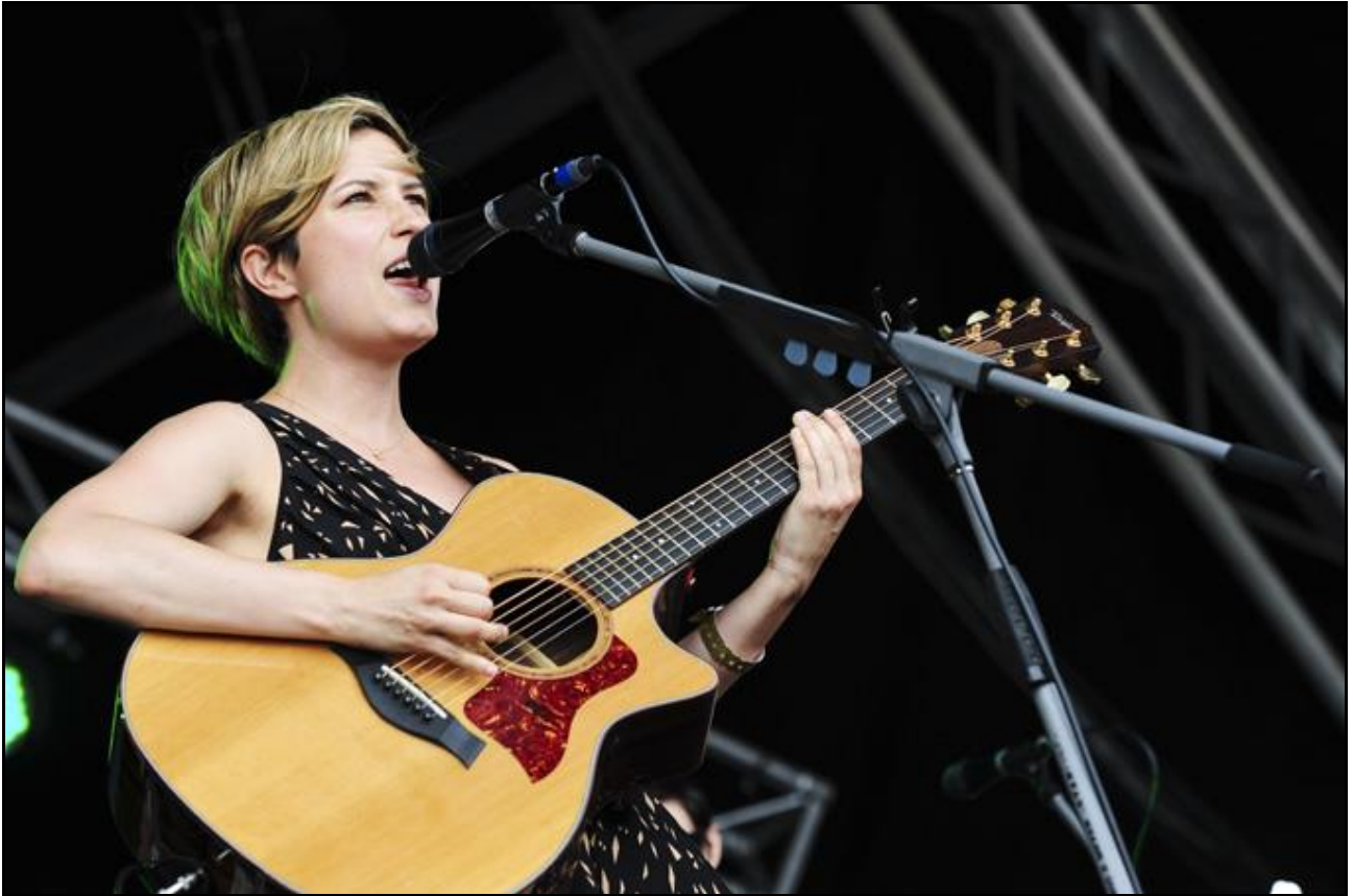
Missy Higgins – Photo: Stuart Sevastos- Wikimedia Commons Licence