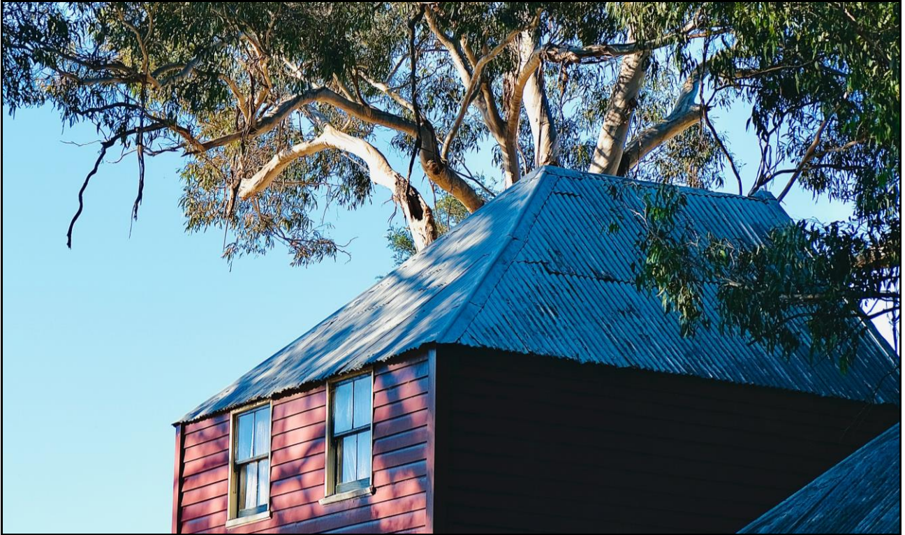
Australian Pioneer Village