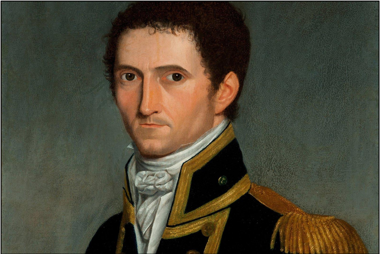
Portrait of Captain Matthew Flinders by Toussaint Antoine de Chazal de Chamereel

Some people and places feature prominently in Australia's political, social and cultural history. The following are just the tip of one very big iceberg.