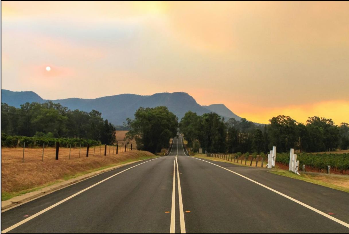
Australian Highway

John Williamson has spent a lot of time in the Outback, which features strongly in many of his songs. In this quiz we refer to him as 'JW'.