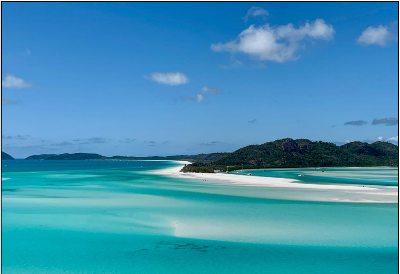
The Whitsunday Islands

Australia has some special islands which are definitely worth adding to a bucket list. Here are some examples. According to Dr Google, Queensland has the greatest number of islands in Australia.