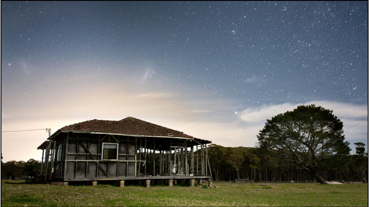
Darkes Forest