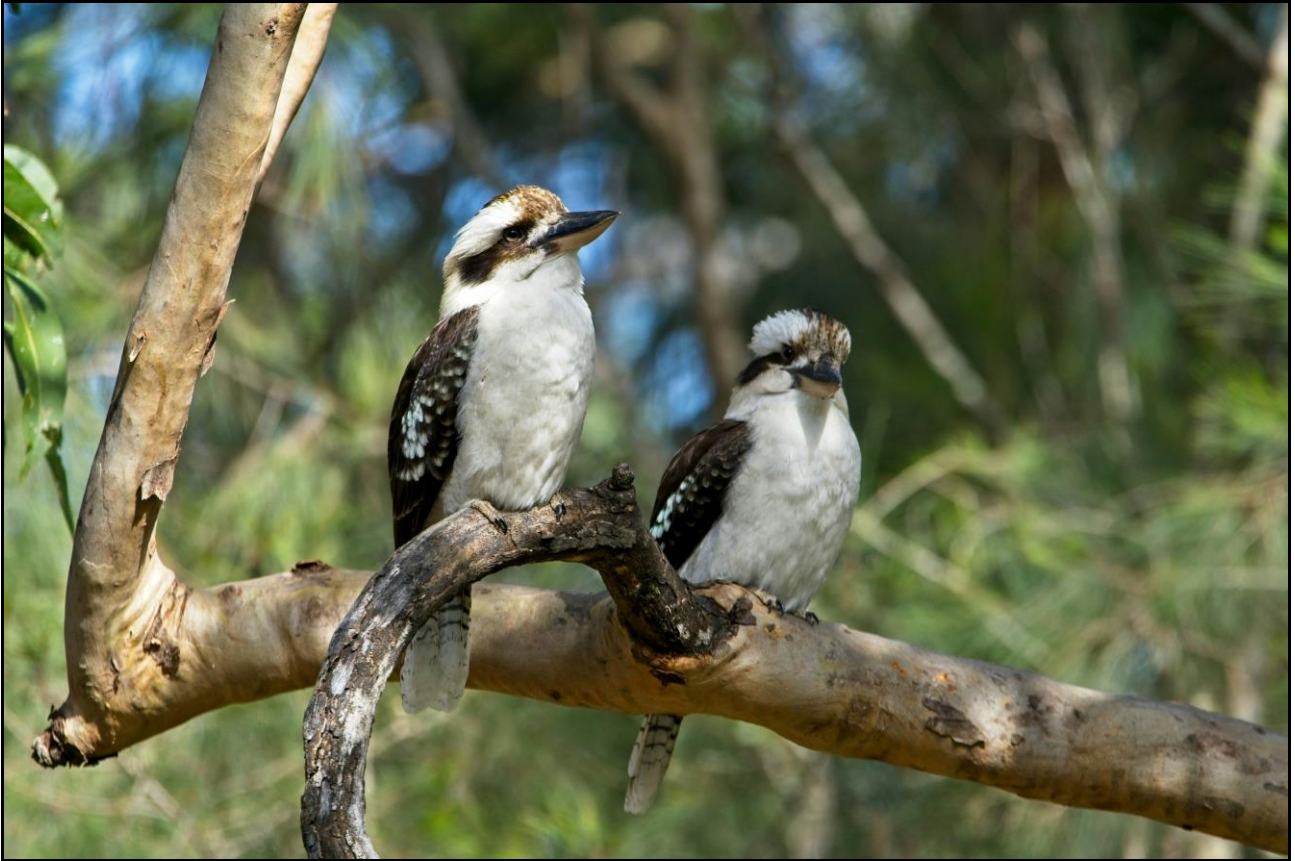
Juvenile and parent Kookaburras