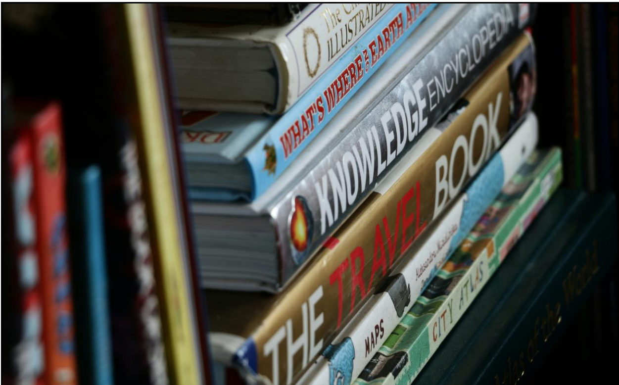
Knowledge Base – Photo: Pierre Bamin - UnSplash Licence

Reading contemporary or classic Australian literature while on the Wallaby can be a good way of getting a feel for the country you are travelling through. This quiz is about some of these books and their authors.