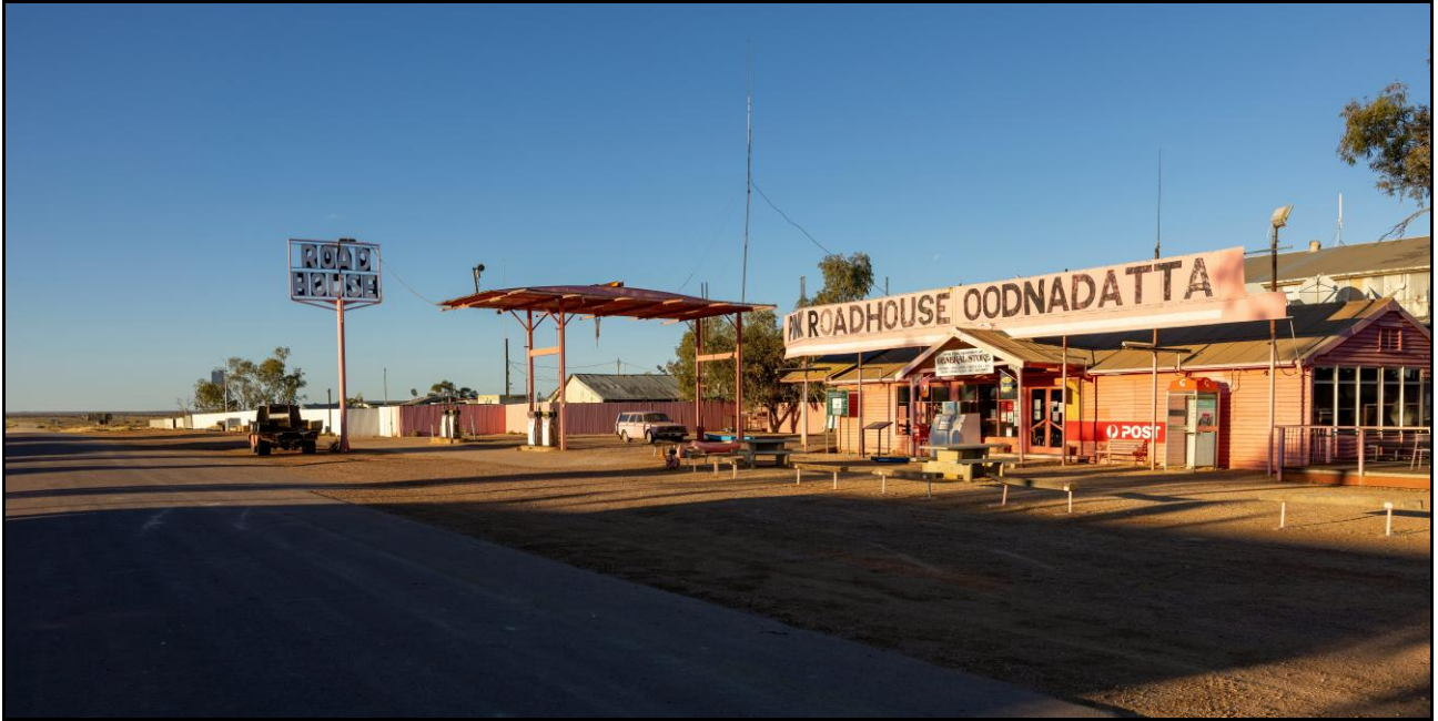
The Pink Roadhouse

Like most smorgasbords this one offers quite a variety, not to eat but certainly to digest!