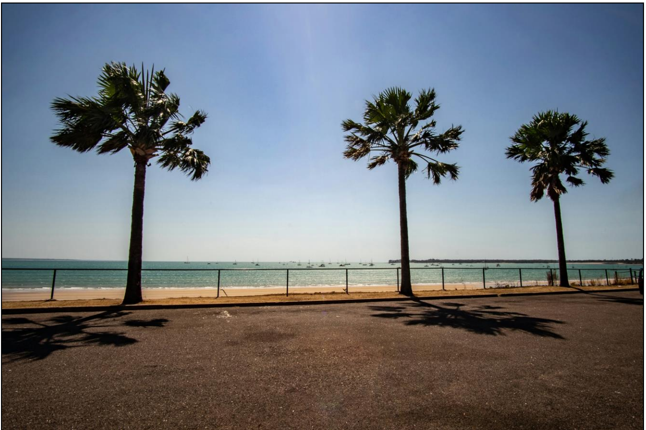
Darwin, Australia – Photo: Harry Down - UnSplash Licence

A trip around Australia by land, by sea, by air or just by map, can be navigated by the use of prominent landmarks. Below are questions about some of these landmarks plus, for variety, some other miscellaneous Aussie topics. Also included are kids only questions so that kids can be active participants.