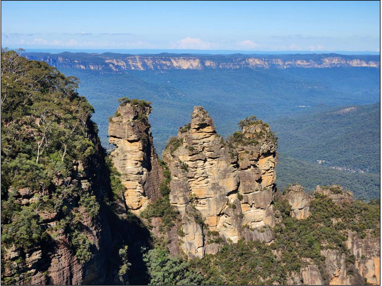
Three Sisters