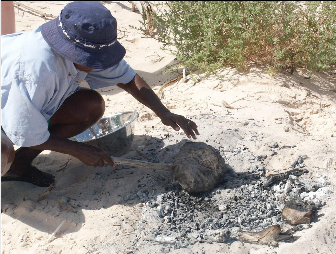
Making Damper