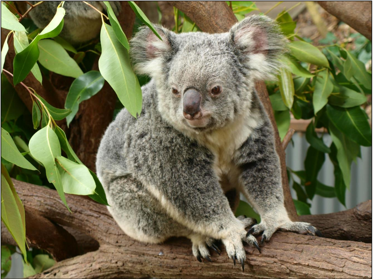
Koala