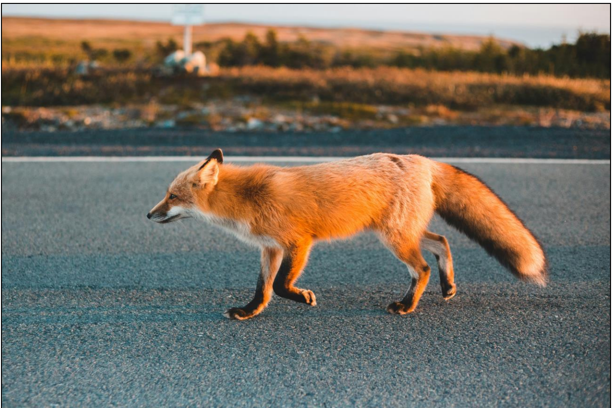
European Red Fox

Wherever you travel in Australia, there are feral and introduced animals. They cause problems basically because they don't belong and many have hard hooves which cause soil erosion. This quiz is about where you might encounter them when you are 'on the Wallaby'.