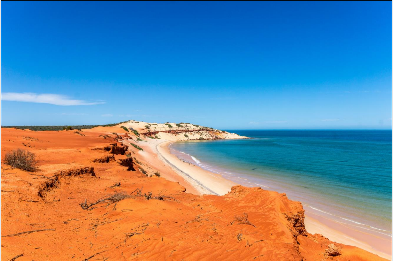
Francois Peron National Park

Darwin has some interesting place names. This quiz identifies some of them.