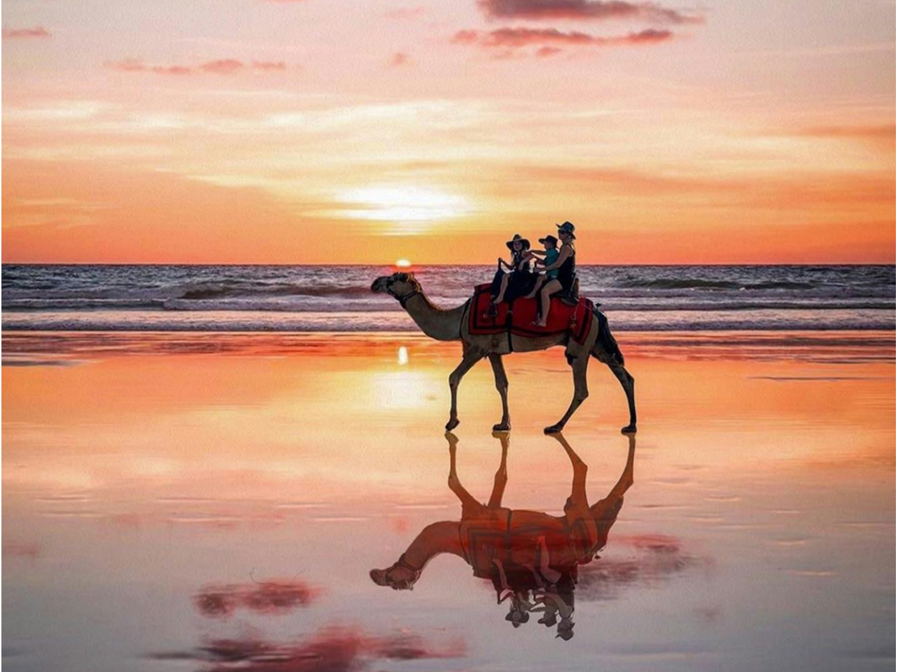
Take the long way home – Cable Beach