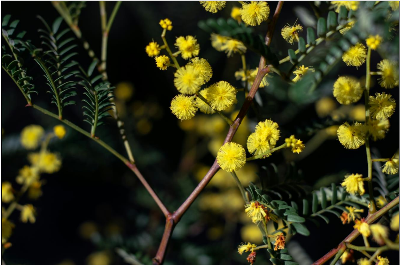
Golden Wattle

Australia has unique flora given its having developed in isolation from the other continents since our separation from Gondwanaland. Both overseas visitors and Australians notice our unique and distinctive flora.