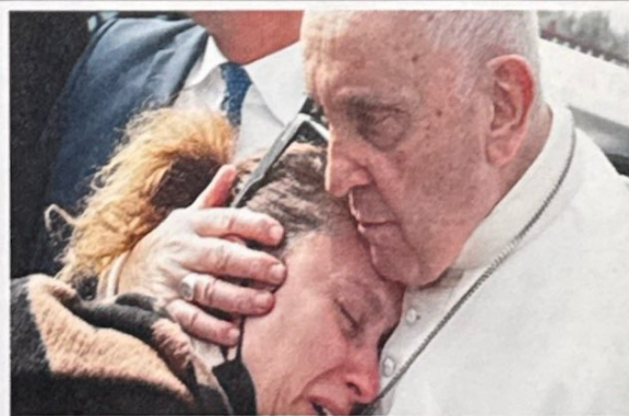
Pope's letter to grieving mother: 'Always ask for Mary's intercession'

I see this book as God's Providential Sign (GPS) for our journey from Mary's grove to Loyola's mission. Led by Mary who mothered us at our Confirmation we now bring the victory of the Eucharistic Heart of Jesus for others to see who they are.