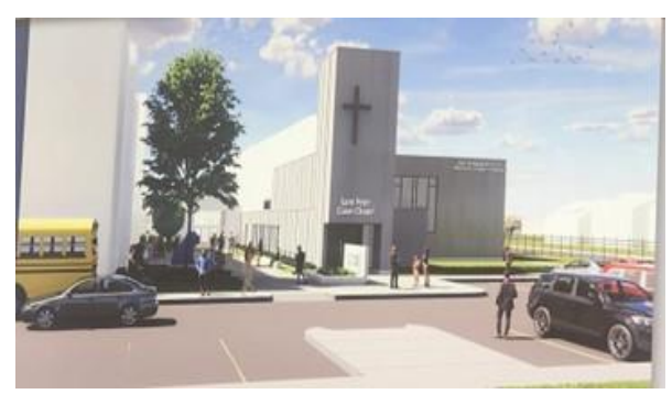
Architectural concept of the New SPCCC

COMMUNITY Meal - Thursday, October 12th 7 pm - Dance shoes required