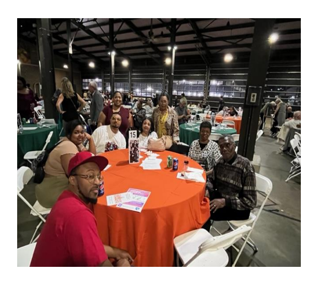
Harvest Dinner at Eastern Market