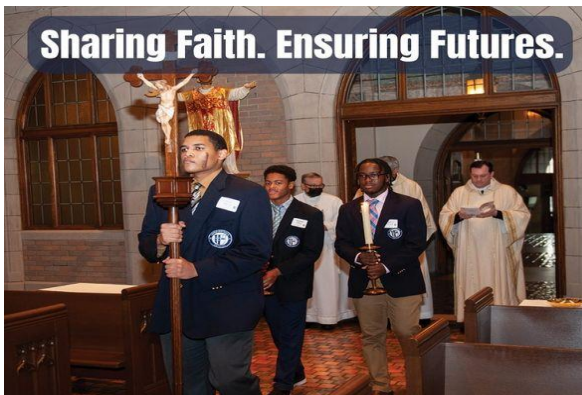
Loyola High School's Annual Appeal. Learn more at: http://loyolahsdetroit.org/2023-

As we celebrate Holy Family, I invite us to reflect upon the quality of our personal and parish family. Silence leads to wise and mature decisions? Family life turns obstacles into opportunities? Work is fulfilling? How are we all doing?