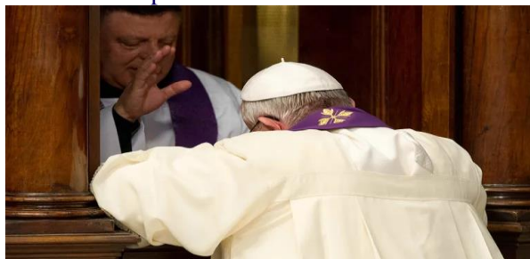
Pope Francis at Confession

How wise our Redeemer is! He knows the grace within us is in earthen vessels, which are fragile and weak. He loves as just as we are. He has given us a sacrament to heal us when we hurt others or wound ourselves. He wants to continue to send us. But once we know ourselves as fallen, He can send us to be his Ambassadors of forgiving.