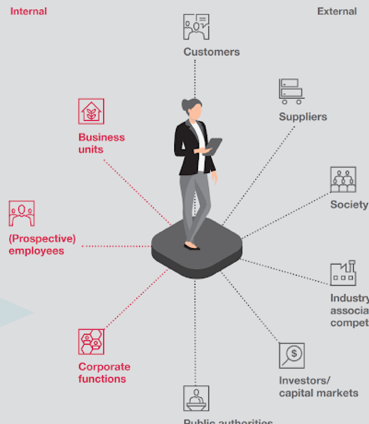
CSOs and their stakeholders

Pressure & conflicting KPIs from stakeholders