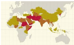
Christians Persecution today Church

https://www.wordproject.org/download/bibles/index.htm