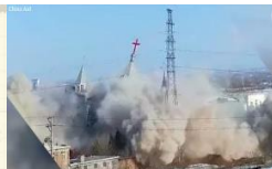
Chinese authorities demolish