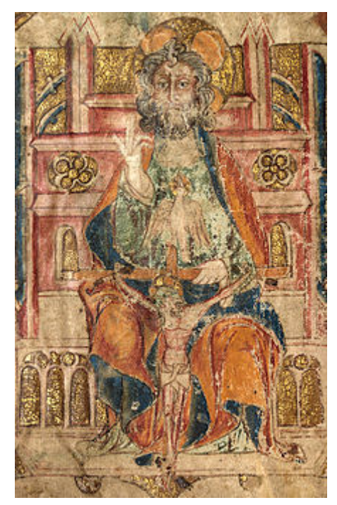
It is sometimes claimed that Christianity is not truly monotheistic because of its idea of the Trinity

Mormons teach that scriptural statements on the unity of the Father, the Son, and the Holy Ghost represent a oneness of purpose, not of substance.[37] They believe that the early Christian church did not characterize divinity in terms of an immaterial, formless shared substance until post-apostolic theologians began to incorporate Greek metaphysical philosophies (such as Neoplatonism) into Christian doctrine. [38][39] Mormons believe that the truth about God's nature was restored through modern day revelation, which reinstated the original Judeo-Christian concept of a natural, corporeal, immortal God, [40] who is the literal Father of the spirits of humans. [41] It is to this personage alone that Mormons pray, as He is and always will be their Heavenly Father, the supreme "God of gods" (Deuteronomy 10:17). In the sense that Mormons worship only God the Father, they consider themselves monotheists. Nevertheless, Mormons adhere to Christ's teaching that those who receive God's word can obtain the title of "gods" (John 10:33–36), because as literal children of God they can take upon themselves His divine attributes.[42] Mormons teach that "The glory of God is intelligence" (Doctrine and Covenants 93:36), and that it is by sharing the Father's perfect comprehension of all things that both Jesus Christ and the Holy Spirit are also divine. [43]