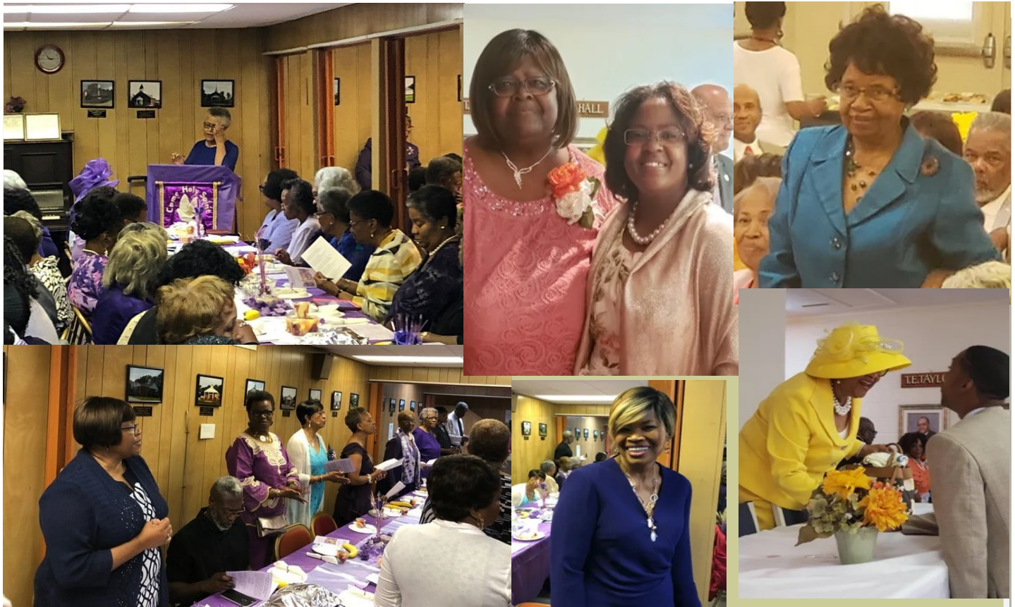
Woman's Auxiliary Prayer Breakfast & Annual Banquet 2019