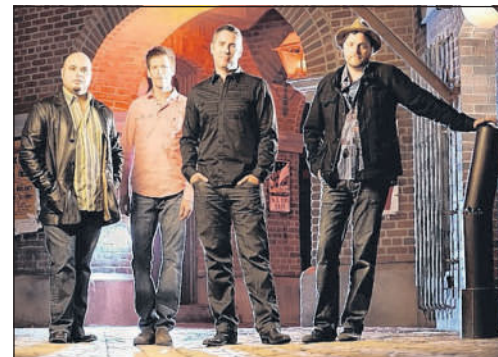
The Barenaked Ladies head to Waukegan's Genesee Theatre Tuesday, May 16.

"And it's nice to be sharing the bill with a band like Hall & Oates. It makes the whole thing a bit more relaxing, takes some of the pressure off," he said. "And honestly, we've been doing this a long time, and we're better at it now. I think our fans will definitely enjoy it."