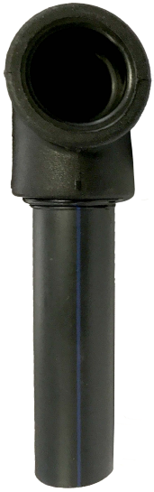
Only complete UV system for both pipe and fittings.

A unique solution for pipe installation outside that REQUIRES NO SCRAPING to fuse pipe due to the UV protection embedded into the external layer of the pipe saving labor hours and ensuring ease of installation. The only approved industrial strength pipe of its kind, made with long term durability to high temperature-pressure application (PP-RCT 125) that enables long term UV protection. The resistance to UV degradation has been increased with the addition of a very innovative UV stabilizer additive system.