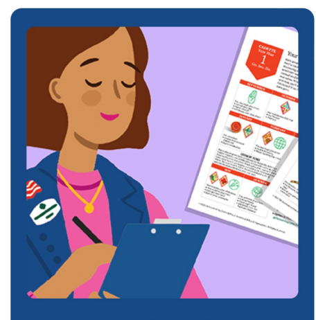
Troop Year Plans