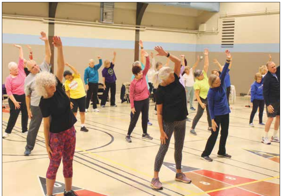
Active Living exercise program at the Boos Recreation Center.