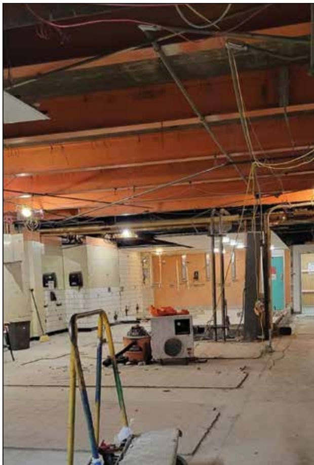
A view from the front lobby where you can now see the door to the pool.