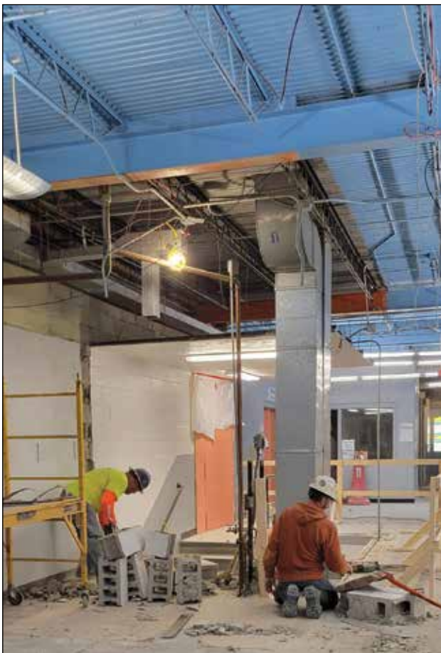
A view from the wellness center entry, showing the removal of the office and work on removing a stairwell.