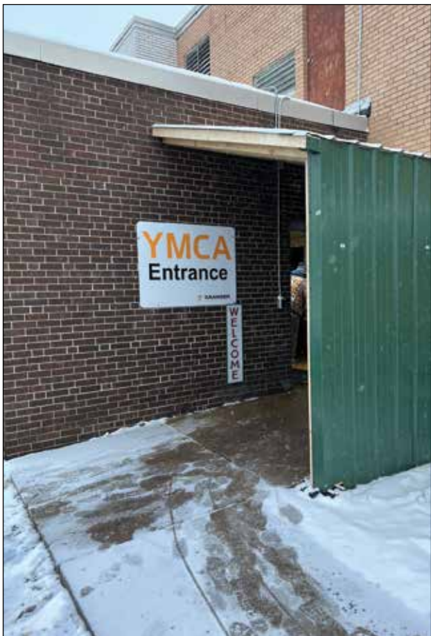
Weather barrier installed at temporary entrance to maintain a comfortable environment.