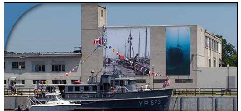
Maritime Cultural Center

During the summer Alpena hosts many festivals to note while planning a visit. Some of my favorites are the