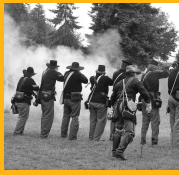
The End of the Civil War April 9, 1865