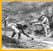
Chattel Slavery 1619-1865