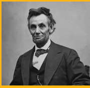
Assassination of Abraham Lincoln April 14, 1865 Confederate sympathizer John Wilkes Booth murdered Lincoln, marking the beginning of the end of reconstruction