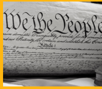
13th Amendment Dec 1865 The 13th Amendment legalized slavery as punishment for crime.