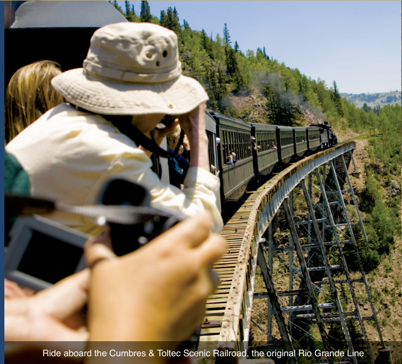
Ride aboard the Cumbres & Toltec Scenic Railroad, the original Rio Grande Line