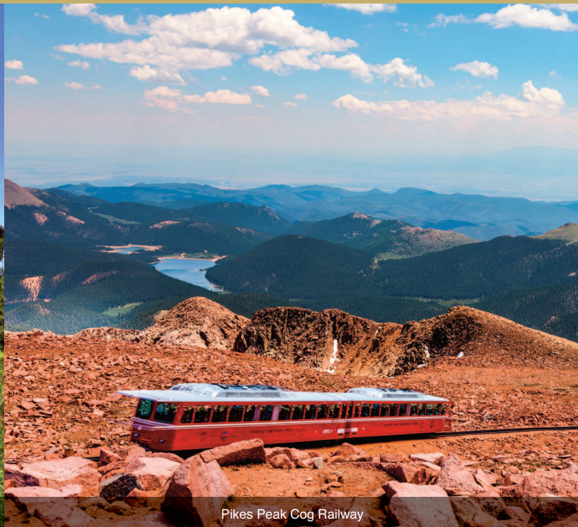
Pikes Peak Cog Railway

fired, steam-operated and are maintained in their original condition. Later, check into the Sky Ute Casino Resort where you may wish to give “Lady Luck” a try. Meals: B, D