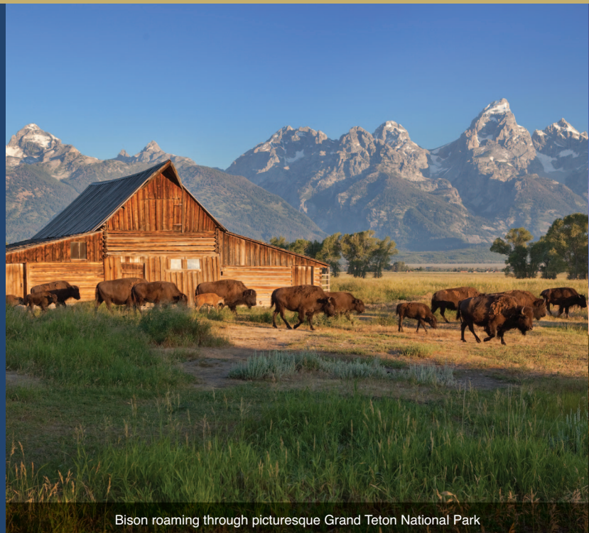
Bison roaming through picturesque Grand Teton National Park

Day One – DoubleTree Hotel, Denver, Colorado Days Two and Three – Holiday Inn Rushmore Plaza, Rapid City, South Dakota Day Four – Holiday Inn, Sheridan, Wyoming Days Five and Six – Yellowstone National Park Lodges, Yellowstone National Park, Wyoming Days Seven and Eight – Antler Inn, Jackson, Wyoming Day Nine – DoubleTree Hotel or Radisson Hotel, Salt Lake City, Utah