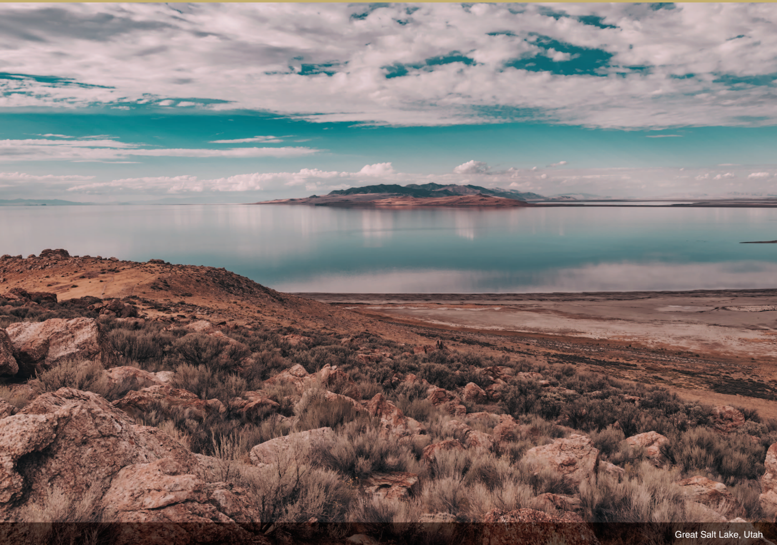
Great Salt Lake, Utah