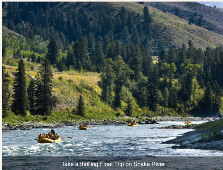
Take a thrilling Float Trip on Snake River

After breakfast transfer to the Salt Lake City International Airport for flights home anytime today. Meal: B