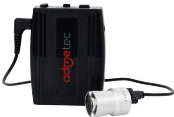
ORCHID / ORCHID-F