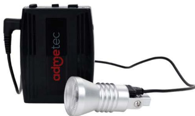
ORCHID-S / ORCHID ERGO

The ORCHID light is the first of its kind in the global market. It is remarkable for being lightweight while still providing a well-focused and shadow-free light.