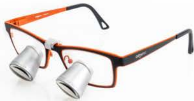
2.5x | JAZZ

High quality Galilean binoculars installed into the loupes are extremely close to the eye and therefore provide a wide field of vision.