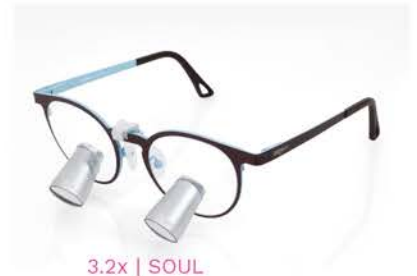
3.2x | SOUL