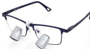
2.7x | INDIE