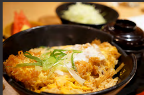
chicken katsu don