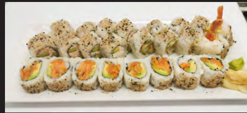
D2 roll combo