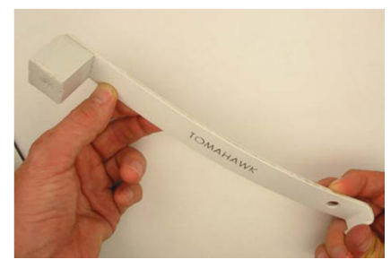
A bump key hammer.